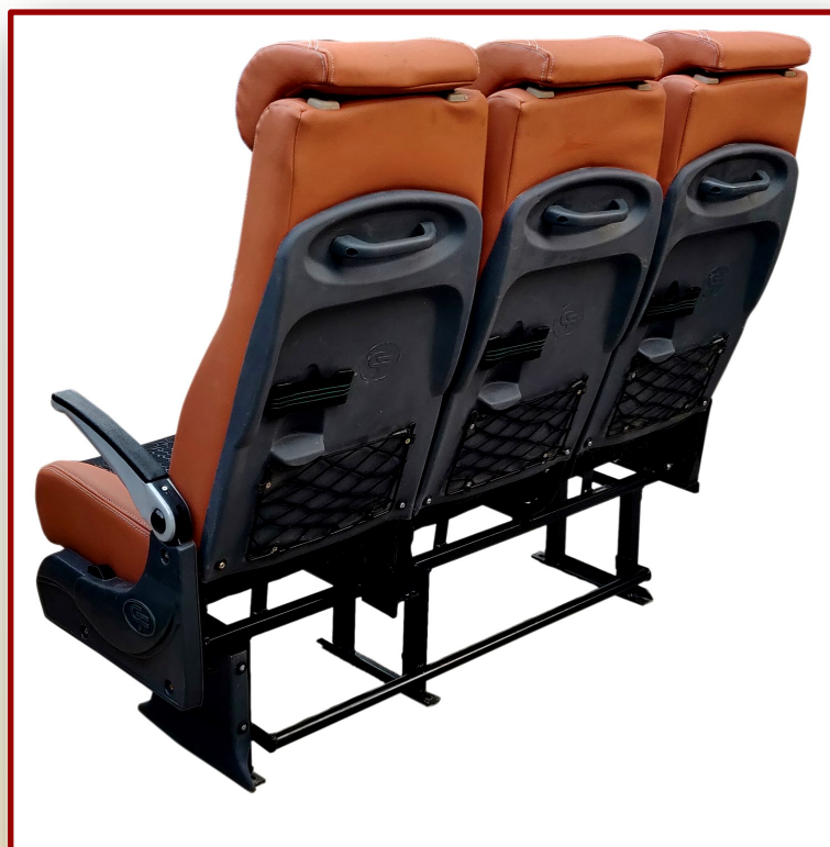
TEMPO TRAVELLER SEAT