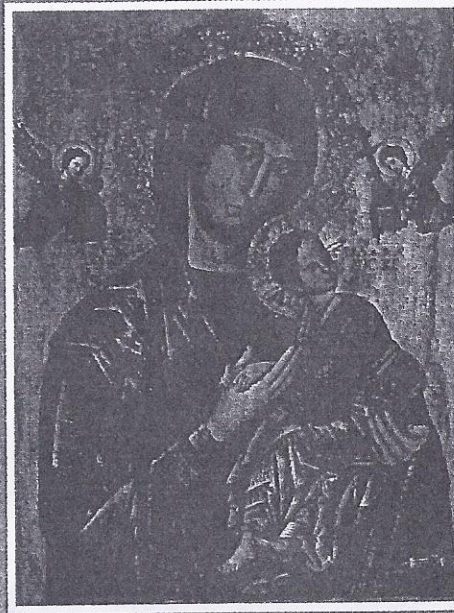
Our Mother of Perpetual Help

Even the friends and disciples of Jesus sometimes brought their problems to Mary, trusting in her closeness to her Son. At the wedding feast at Cana, Mary steps in to help when the wine begins to run low. Still, Mary reminds the disciples that they must rely only on Jesus with the words, "Do whatever he tells you" (John 2:5). Mary also prayed with the disciples while they waited for the coming of the Spirit (Acts 1:14). These events take on an even greater significance when we understand that, at the time of Jesus, women had very little social standing.