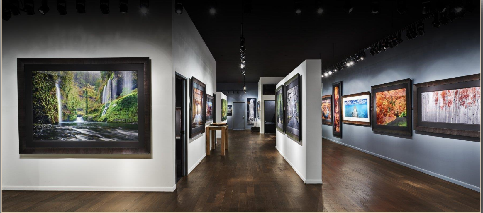
Lik Gallery, Houston TX Thermo-treated Elm