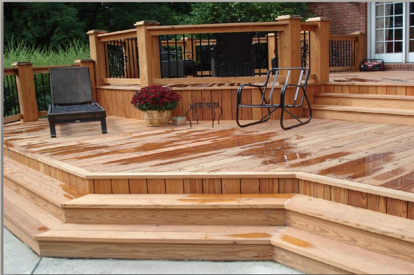
Private residence, Ohio Thermo-treated SYP