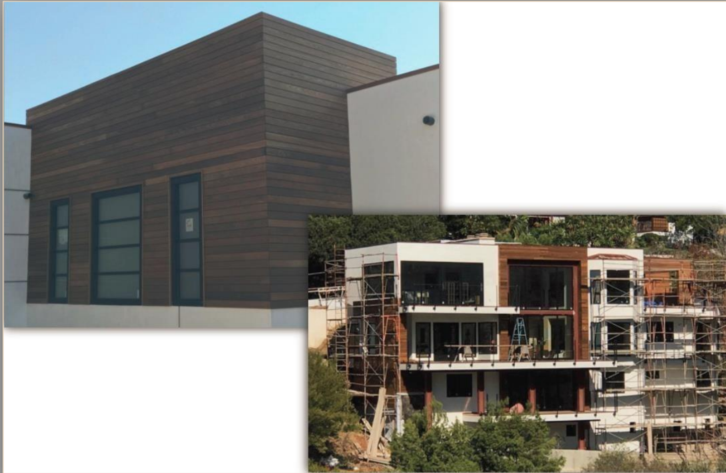
Private residence, Santa Ana CA Thermo-treated Ash