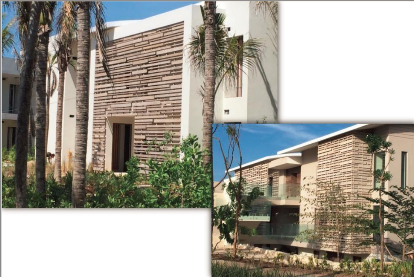
Hyatt Hotel, Mexico City, Mexico Thermo-treated Pine