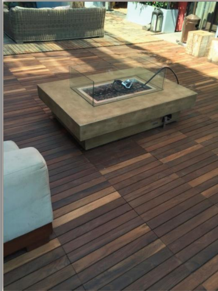
Rooftop Hotel Patio, Las Vegas NV Thermo-treated Oak