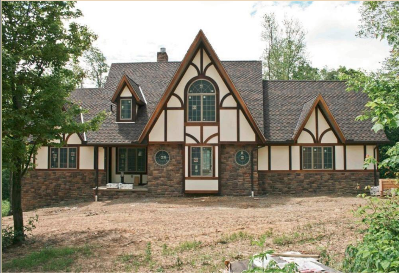
Private residence, Ohio Thermo-treated Poplar