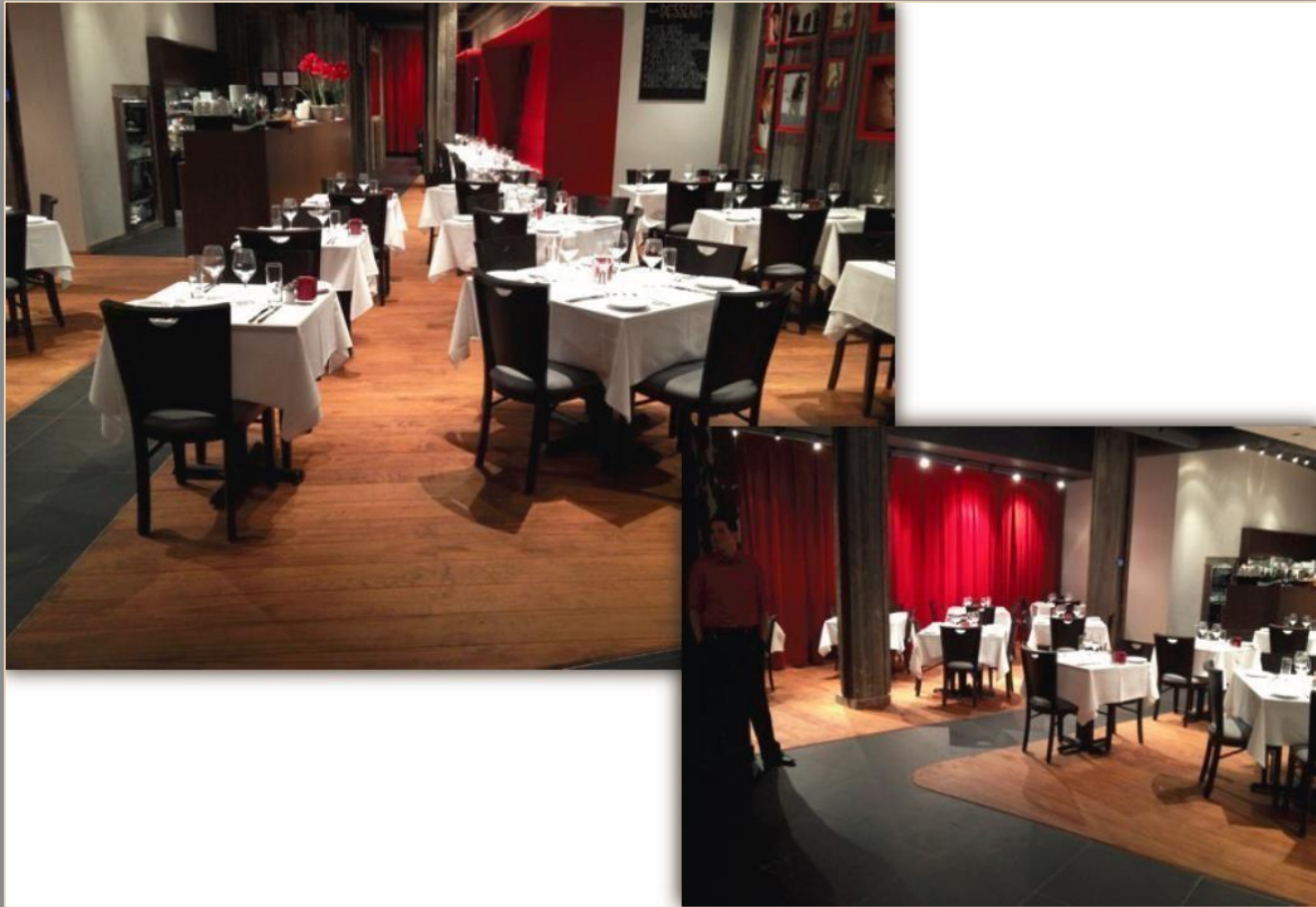
Restaurant, Canada Thermo-treated Pine