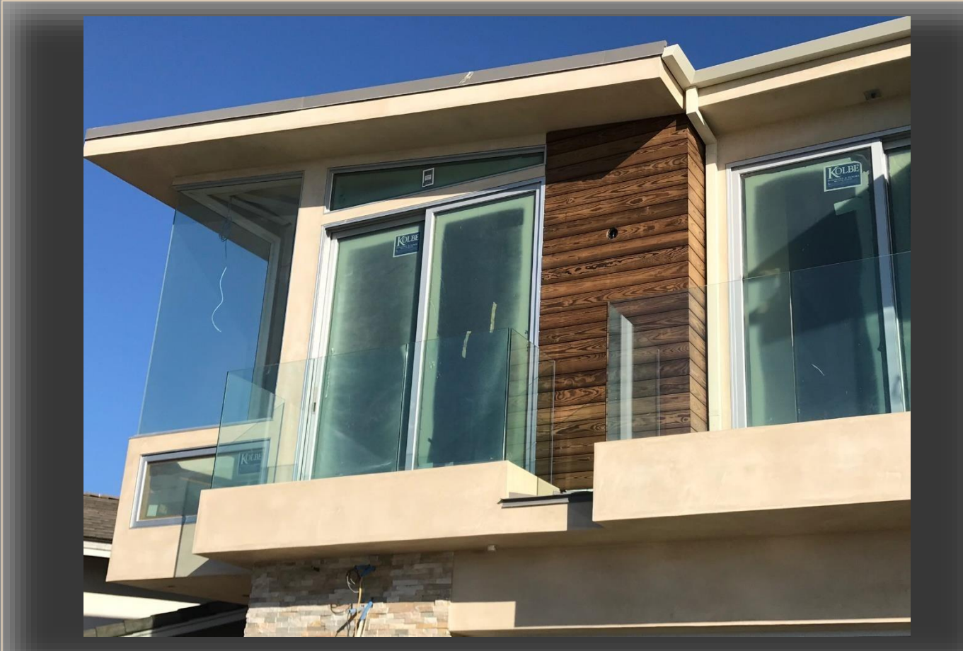
Townhouse development, southern CA Thermo-treated & oiled SYP