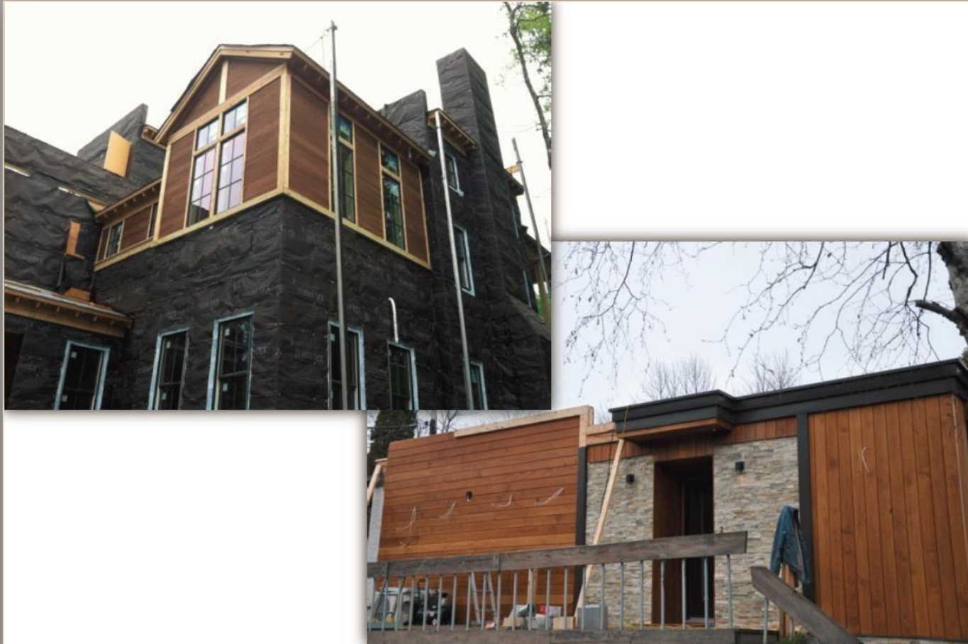
Private residence, Tennessee Thermo-treated Poplar