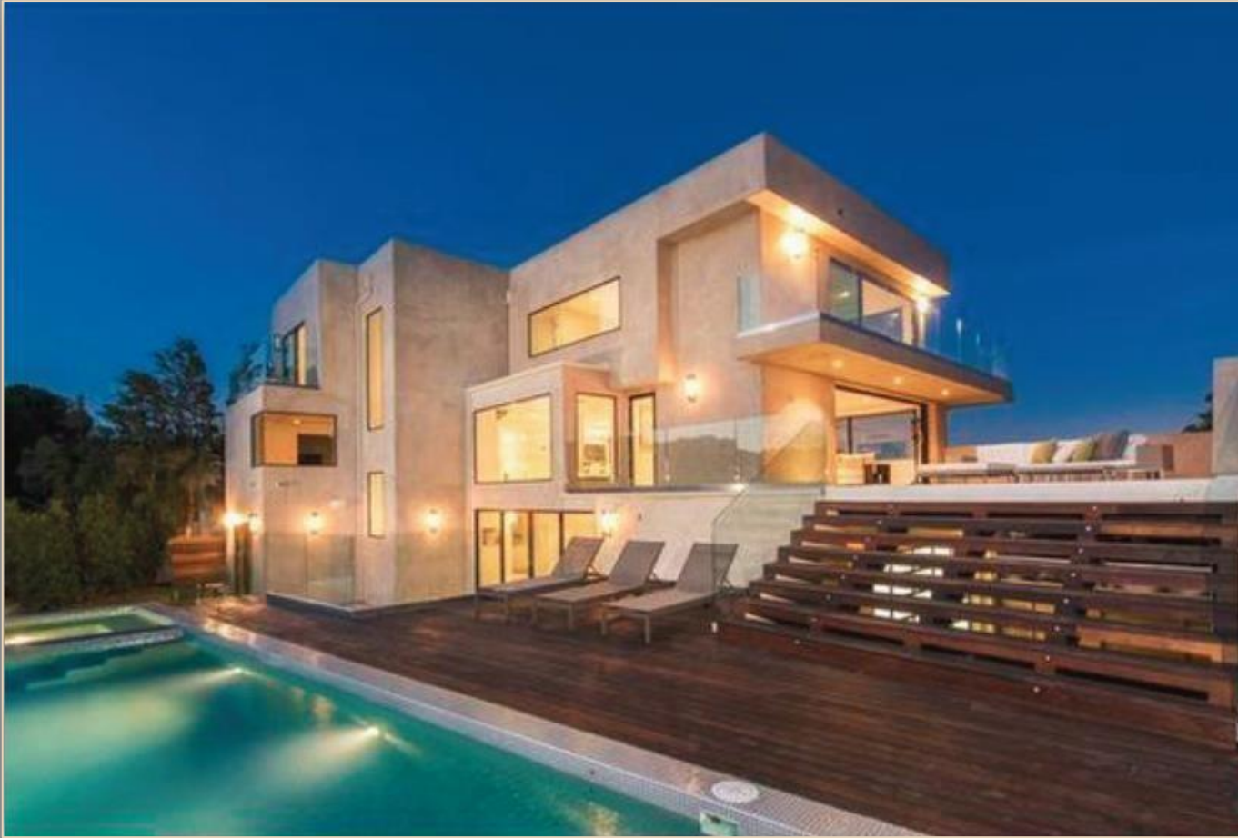
Private residence, Beverly Hills CA Thermo-treated Ash