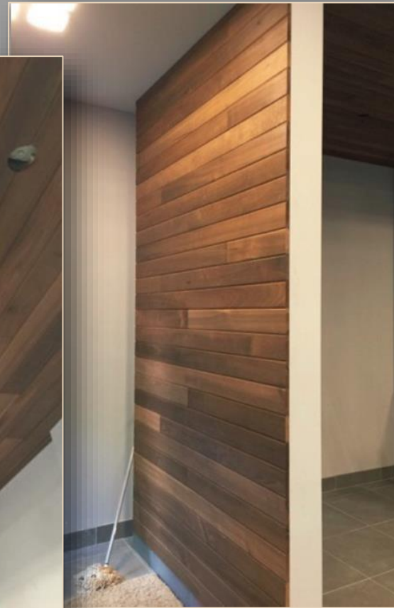
Private residence, Ohio Thermo-treated Poplar