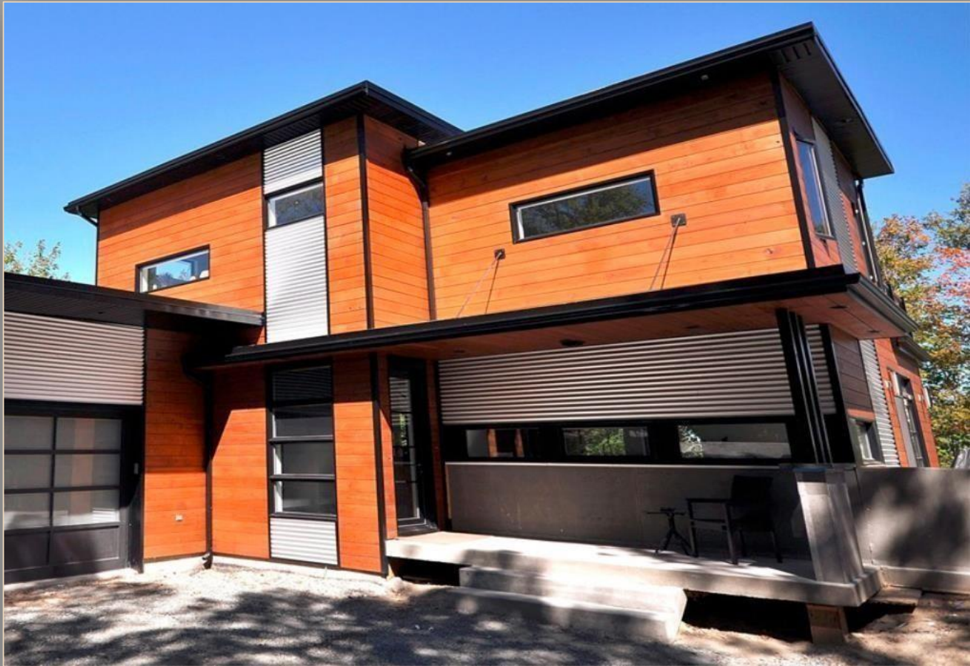
Private residence, Quebec Canada Thermo-treated Pine