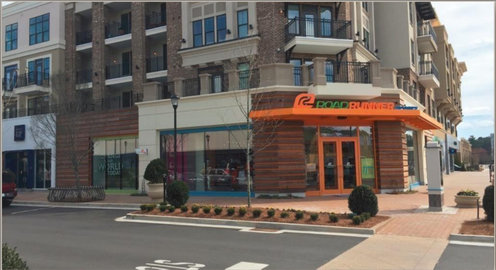
Commercial facade, Atlanta GA Thermo-treated Ash