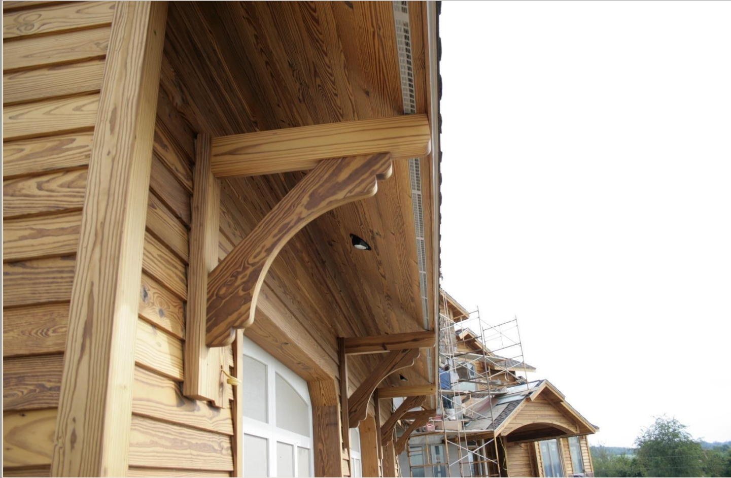
Private residence, Ohio Thermo-treated & oiled SYP