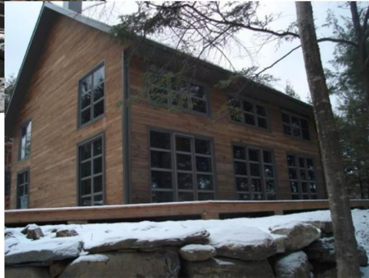
Private residence, Canada Thermo-treated Sap Gum