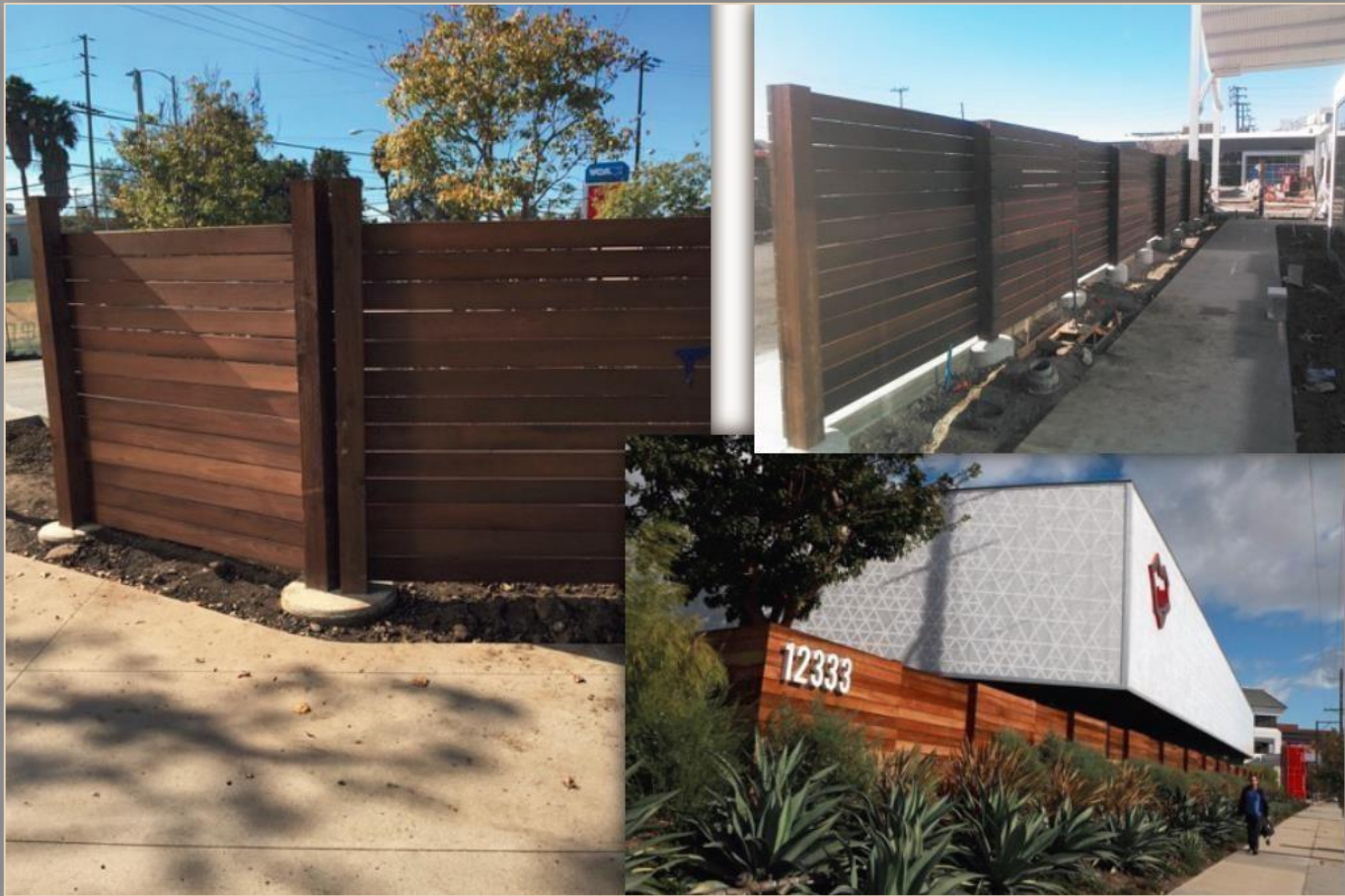
Office Building, Los Angeles CA Thermo-treated Poplar