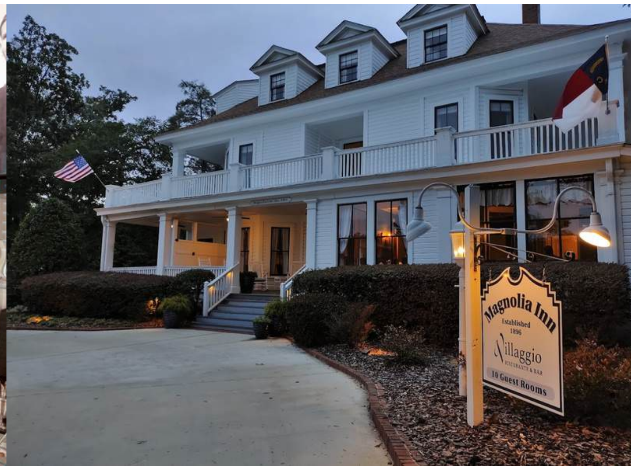
5-Star Dining - Villaggio Restaurant