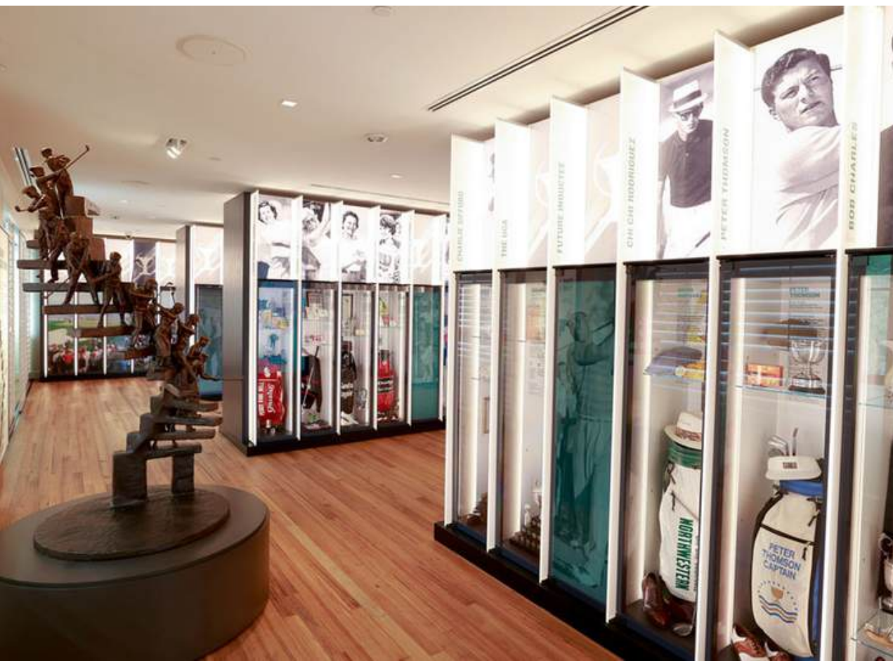
USGA / World Golf Hall of Fame