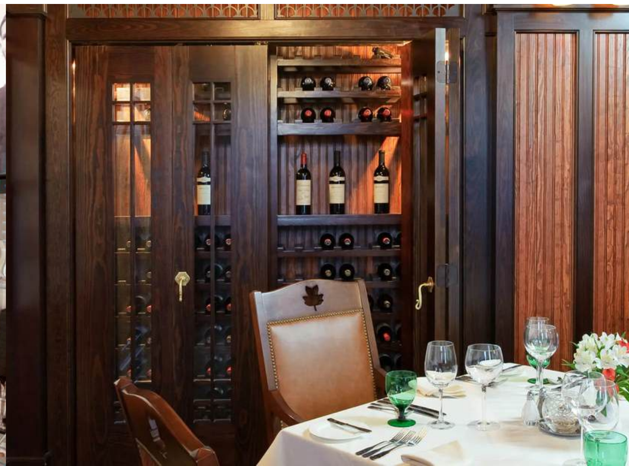
5-Star Dining - 1895 Grille