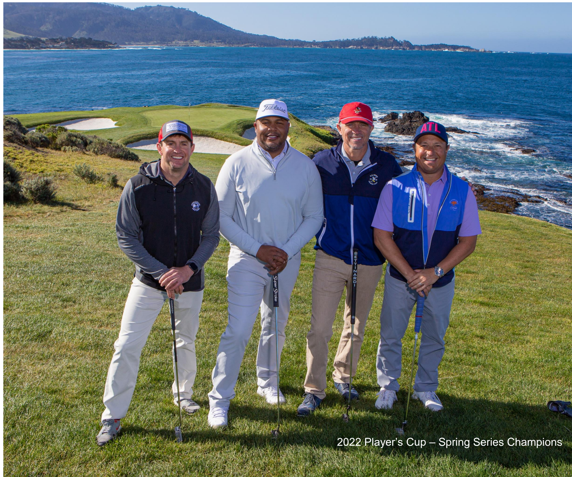
2022 Player's Cup – Spring Series Champions

*Callaway prizes for closest to the Pin & Long Drive