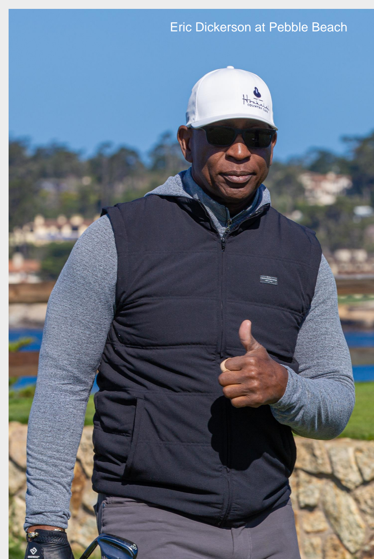
Eric Dickerson at Pebble Beach