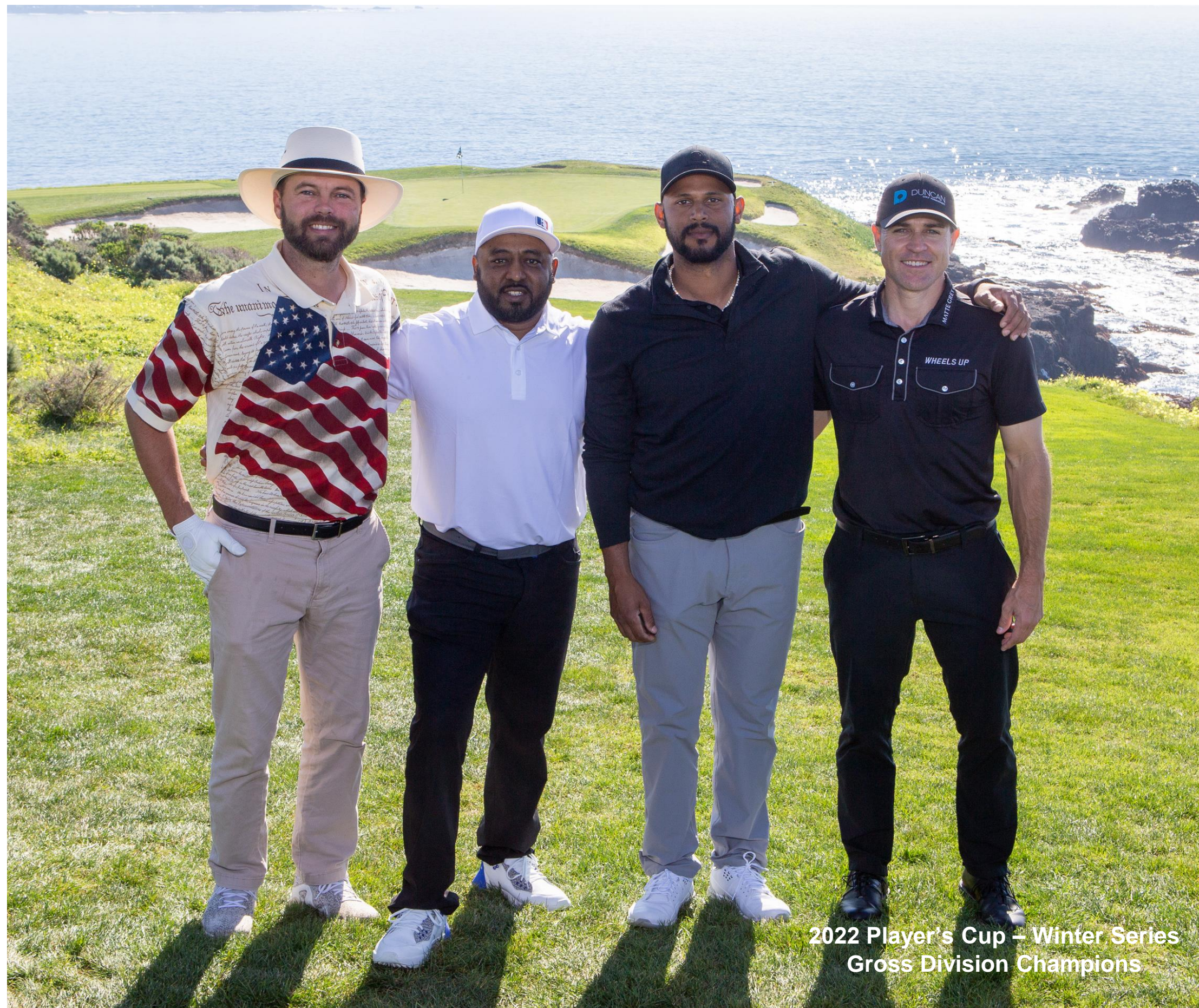
2022 Player's Cup – Winter Series Gross Division Champions

*Callaway prizes for closest to the Pin & Long Drive