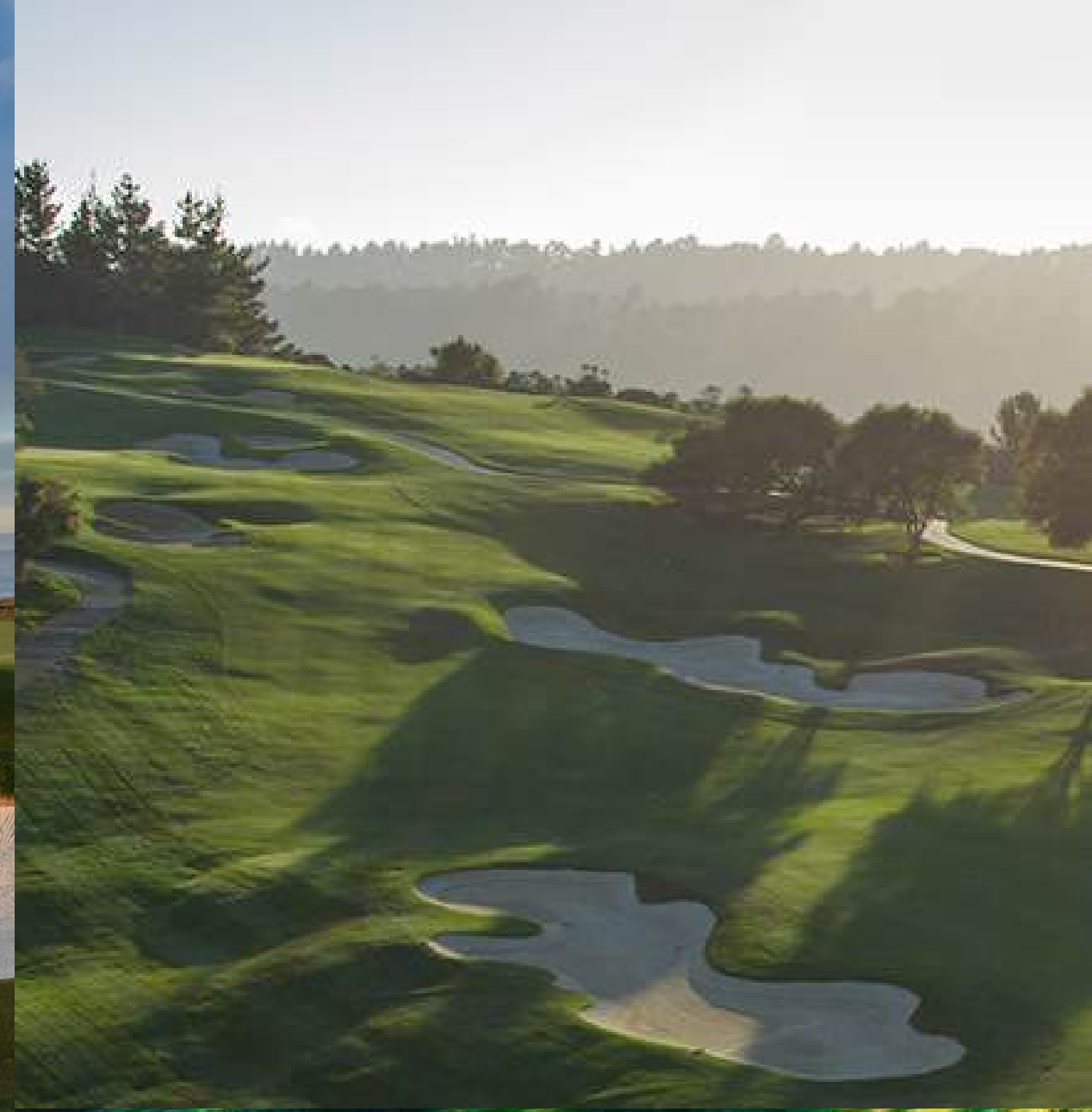
TEHAMA GOLF CLUB

Spyglass Hill is Pine Valley-by-the-Sea meets Augusta National, says Sports Illustrated. Other major golf publications propose it is the best course yet to have hosted a Major.