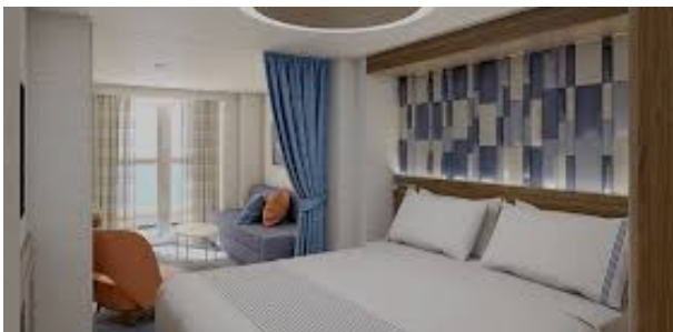
Balcony $1174 per person/double occupancy