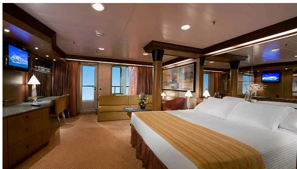
Suite $1434 per person/double occupancy

Photos shown are representative of the cabin style only. Actual furnishings, decor, and finishes will vary by ship