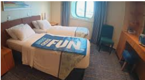
Ocean View Cabin $1044 per person/double occupancy