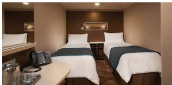
Interior Cabin $939 per person/double occupancy