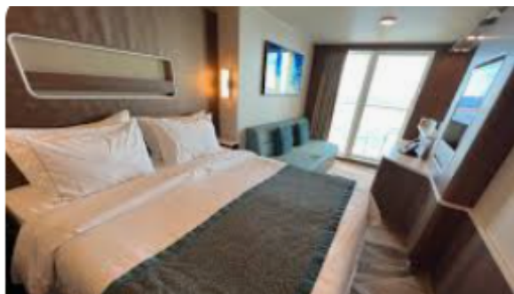
Balcony $1389 per person/double occupancy