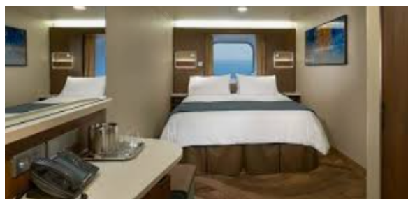
Ocean View Cabin $1179 per person/double occupancy