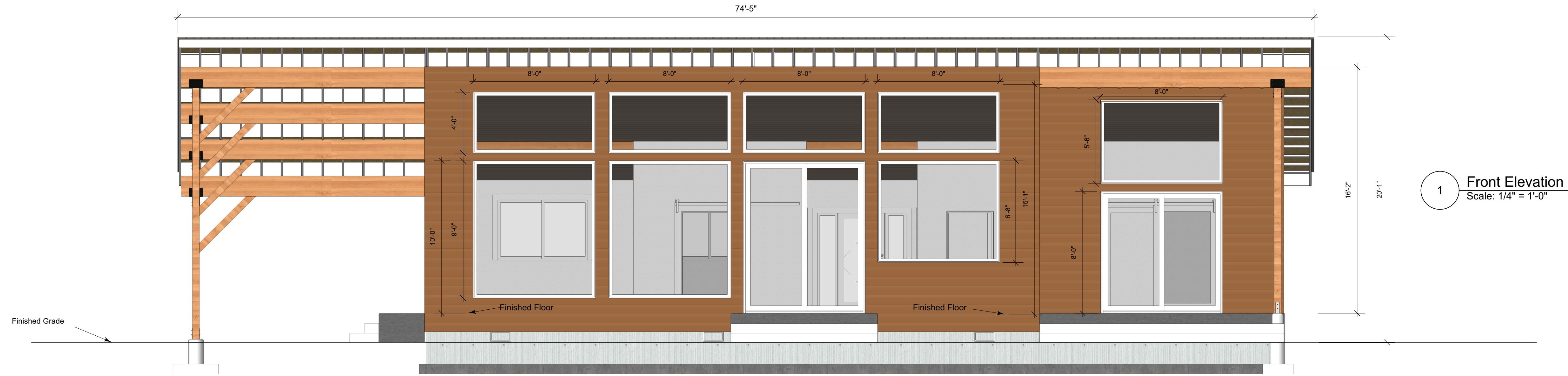
1 Front Elevation Scale: 1/4" = 1'-0"