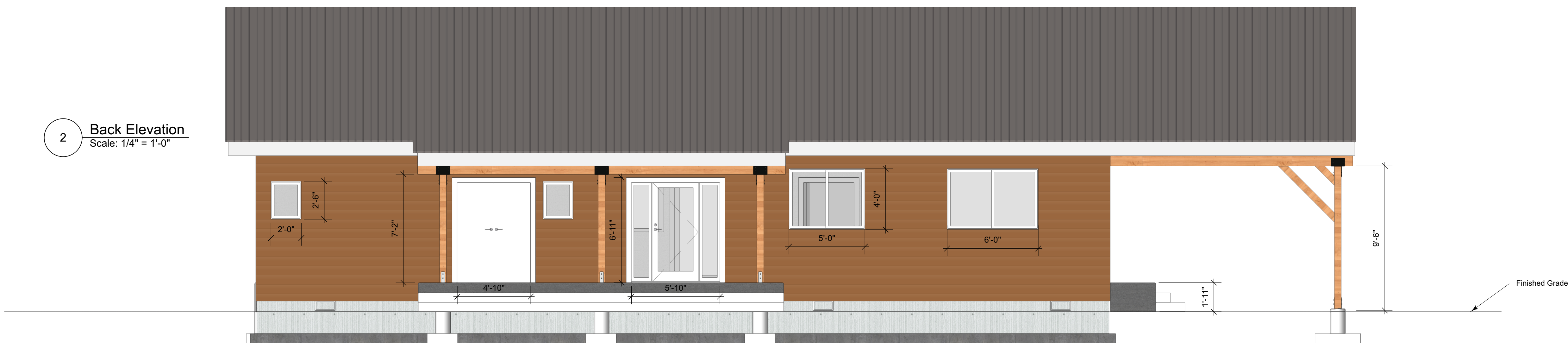
2 Back Elevation Scale: 1/4" = 1'-0"