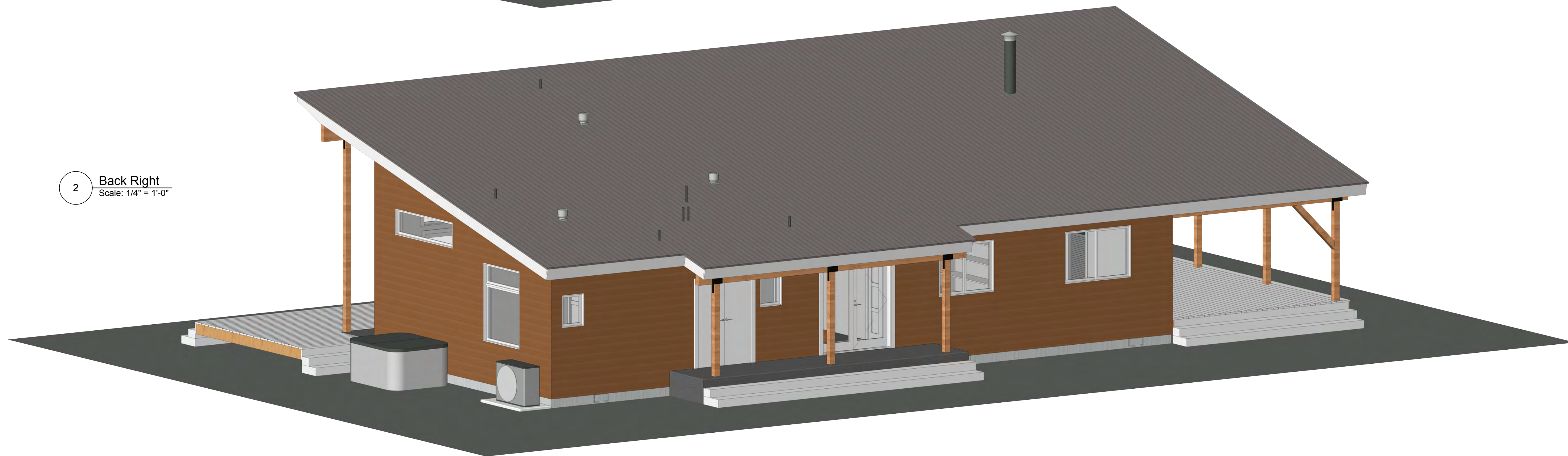
2 Back Right Scale: 1/4" = 1'-0"