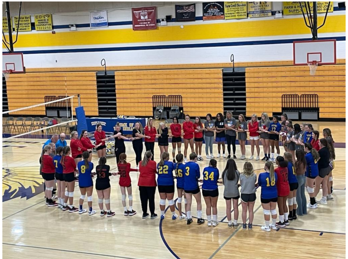
The Lady Indians faced off against the Cherokee Chiefs on August 18th.

The first home game for September will be, on September 6th, against a long-time rival Cosby in many sports, starting at 5:00 Pm.