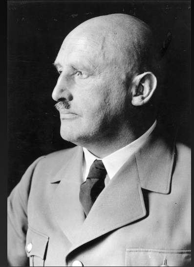
Wikipedia contributors. (2021, February 13). Julius Streicher. In Wikipedia, The Free Encyclopedia . Retrieved 03:12, February 21, 2021, from https://en.wikipedia.org/w/index.php?title=Julius_Streicher&oldid=1006471704

Streicher was hanged at Nuremberg Prison in the early hours of 16 October 1946, along with the nine other condemned defendants from the first Nuremberg trial. Göring, Streicher's nemesis, committed suicide only hours earlier. Streicher's was the most melodramatic of the hangings carried out that night. At the bottom of the scaffold he cried out "Heil Hitler!". When he mounted the platform, he delivered his last sneering reference to Jewish scripture, snapping " Purimfest! "