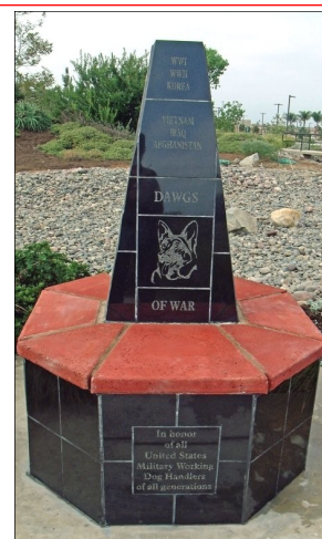
Dawgs of War- Veteran K9 Memorial located at Camp Pendleton

Patriots 4 Pendleton is happy to be sponsoring the 15th MEU's St. Patrick's day event which will be the second family event this year. If you'd like to donate to help with the cost of food and door prizes please mail your donation to the address shown to the right. Please be sure to write St. Patrick's Day on the memo line so that your donation will be ear-marked for this specific event. Last year's event was a big hit. Thank you !!!