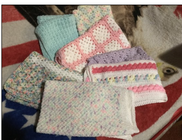
Thank you Shirlene Upward

We have been assembling baby baskets for several units and one of the best things that we can include in a basket is a homemade blanket or quilt. We had two lovely ladies make and donate these beautiful gifts and can hardly wait to make the next round of baskets. You can see the love that they put into their handiwork – such a blessing!