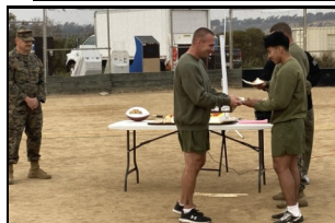
Even our four-legged friend celebrated the USMC birthday this year.