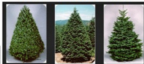
Douglas Fir Grand Fir Noble Fir

#1 Quality Trees from Oregon Family Owned Grower Since 1986