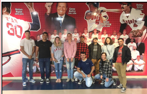
Angel Stadium - September 26, 2021