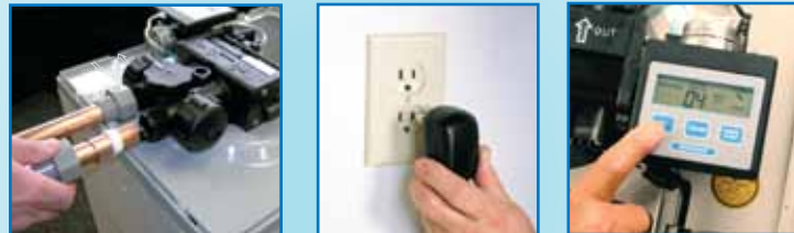
1. Connect to plumbing. 2. Plug in transformer. 3. Set the controller.