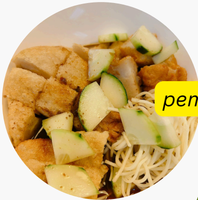
pemek kapal selam