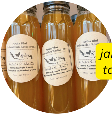
jamu turmeric & tamarind juice