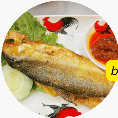
bandeng asap goreng

Fried boneless smoked milkfish *without rice