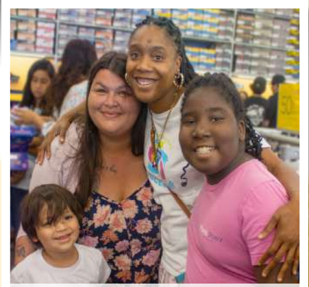
Families picking out shoes