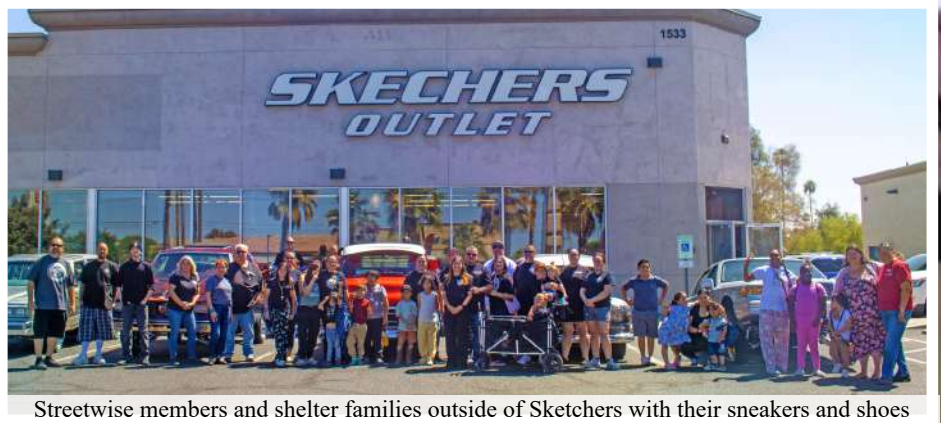
Streetwise members and shelter families outside of Skechers with their sneakers and shoes