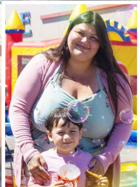
Mother and son enjoying the Easter event

people who donated items for this event. Thanks to your kindness, we were able to give out baskets, food, and gifts to families who needed them. Your support means so much to program participants and Crossroads Mission guests. Thank you for believing in Crossroads Mission and in our goal to glorify God in all parts of life.