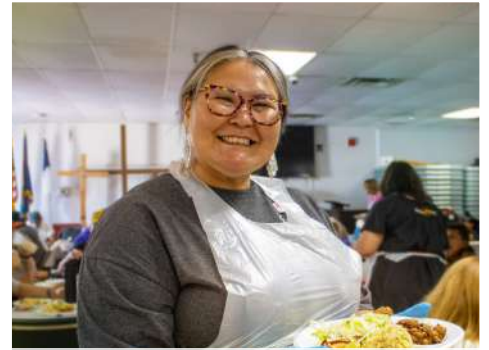
Crossroads' staff serving food during the event

We're grateful for moments like these that bring people together. We thank God for His love and for guiding our mission each day. And we thank our staff, volunteers, and donors who make these meaningful events possible. Your support helps us continue spreading hope, culture, and community to those who need it most.