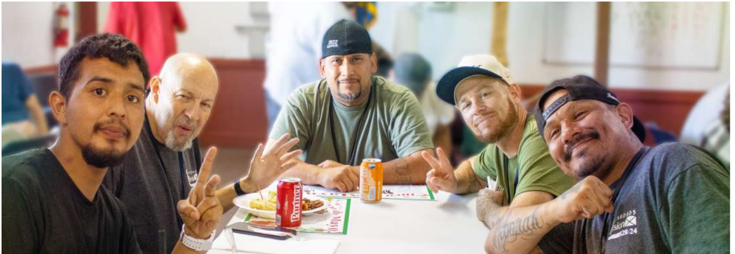
Guests and program participants enjoying a delicious Cinco de Mayo lunch!