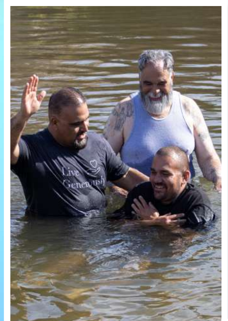
Everyone is excited to be baptized