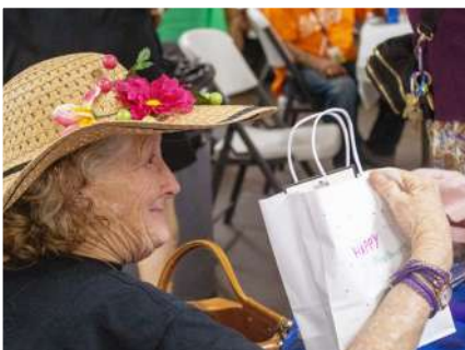
Family shelter women receiving gifts