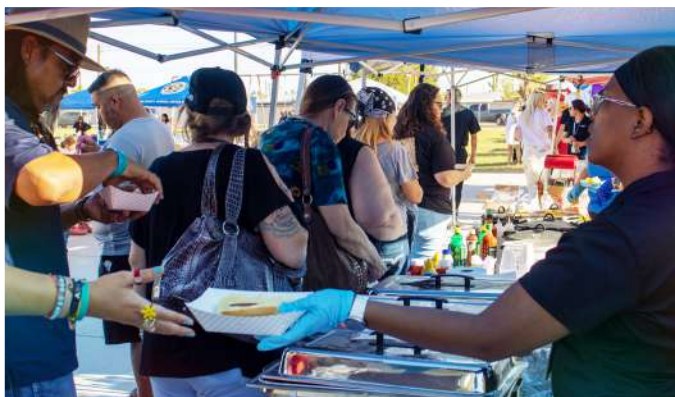
2 Crossroads Mission serving hot dogs to event participants and goers NEWS for our Partners

A pril is Child Abuse Awareness Month, and to honor this important cause, Crossroads Mission partnered with The Healing Journey to host a special community event on April 25th, 2025. The day was filled with delicious food, lively music, fun games, and prizes while sharing valuable information and support. Crossroads Mission staff, along with other community agencies, served meals, led games, handed out prizes, and distributed important health & safety resources for community members on how to keep children safe.