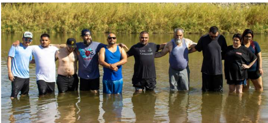
Newly baptized individuals standing in the Colorado River

We give all glory to God, who continues to move powerfully within our Mission. His love transforms lives, and we are honored to witness these moments of surrender and renewal. We also thank all those staff, donors, volunteers, and those who pray for us, who make our work possible and walk alongside us in ministry. God bless those who have been baptized. May they walk boldly in their faith, knowing they are made new in Christ.