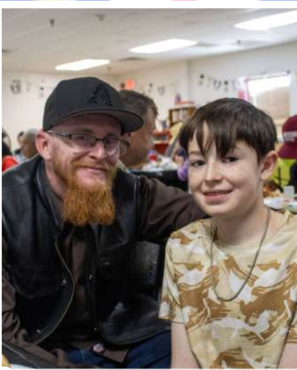
Father and son at the event