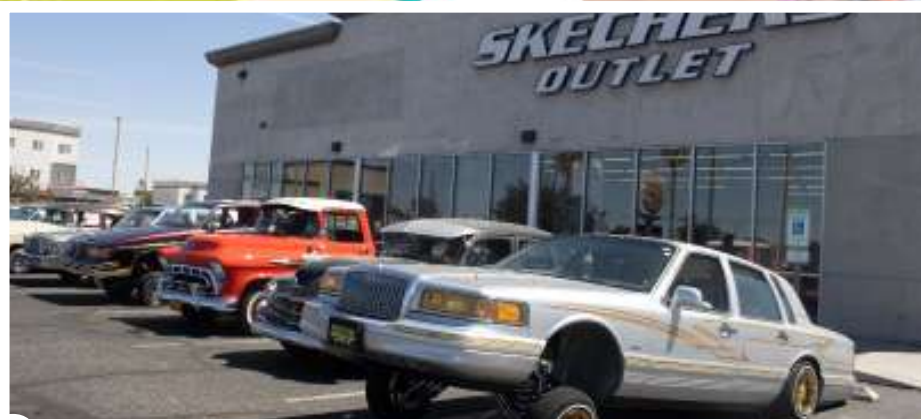
Streetwise showcars outside of Skechers Outlet