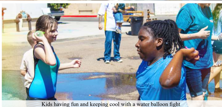
Kids having fun and keeping cool with a water balloon fight