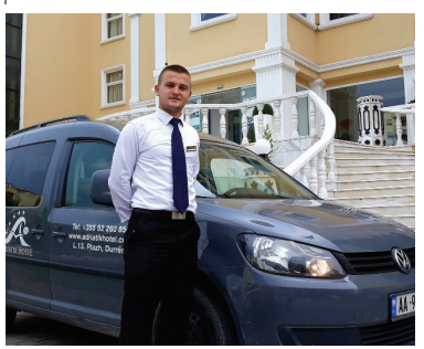
Our Guides and Drivers will be happy to tour you around Albania!