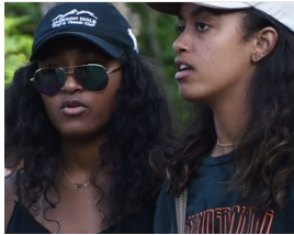
The Stunning Transformation of the Obama Sisters