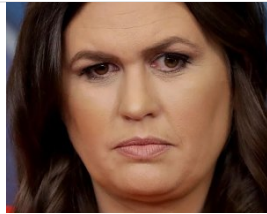
Tourism Still Suffering in Town Where Diner Denied Sanders