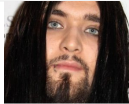
Celeb Kids Who Seriously Disgraced Their Parents