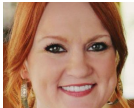
Famous Chefs Who Are Jerks in Real Life