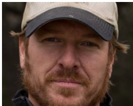
The Truth About Chip Gaines