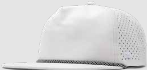
WHITE SMALL | CLASSIC | XL