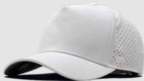
WHITE SMALL | CLASSIC | XL