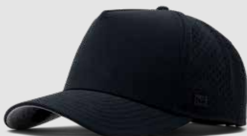
BLACK SMALL | CLASSIC | XL