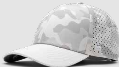
SNOW CAMO SMALL | CLASSIC | XL