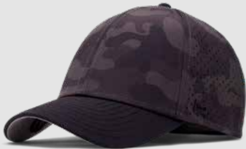
BLACK CAMO SMALL | CLASSIC | XL