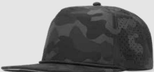
BLACK CAMO CLASSIC