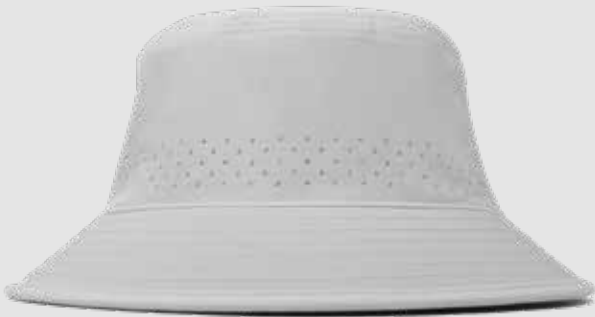
WHITE SMALL | CLASSIC | XL