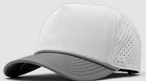
WHITE GREY ROPE SMALL | CLASSIC | XL