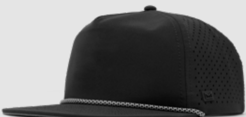
BLACK SMALL | CLASSIC | XL