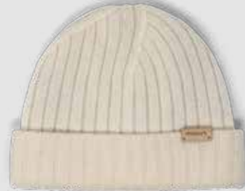
ANTIQUE WHITE OSM AVAILABLE 2026