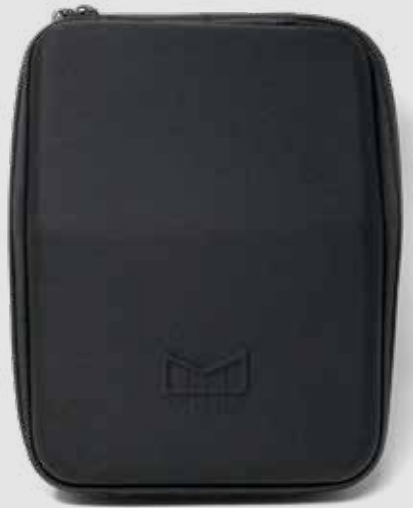
3 HAT TRAVEL CASE BLACK