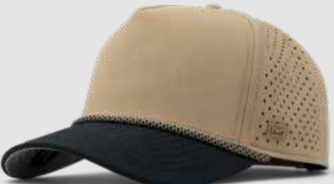
KHAKI BLACK ROPE CLASSIC