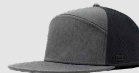
HEATHER CHARCOAL CLASSIC