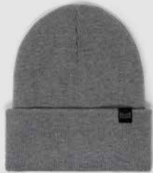
HEATHER CHARCOAL OSM