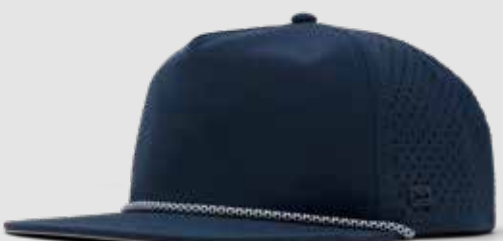
NAVY SMALL | CLASSIC | XL