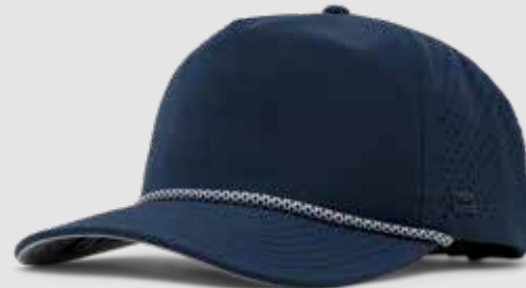
NAVY ROPE CLASSIC