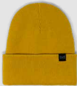
MUSTARD OSM AVAILABLE 2026