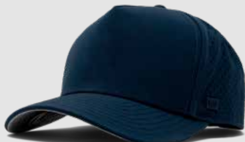
NAVY SMALL | CLASSIC | XL