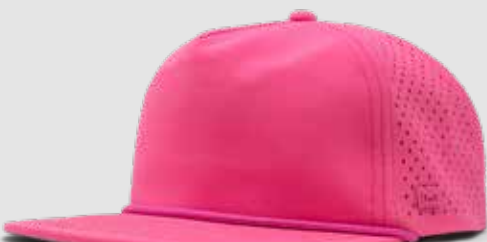
NEON PINK CLASSIC