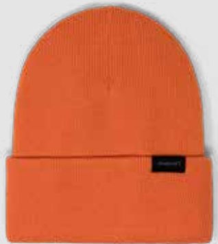
SAFETY ORANGE OSM