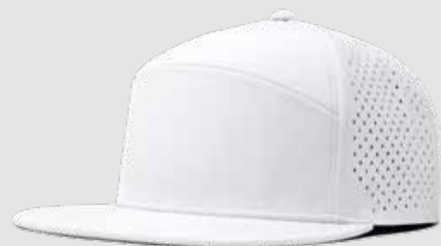
WHITE CLASSIC I XL