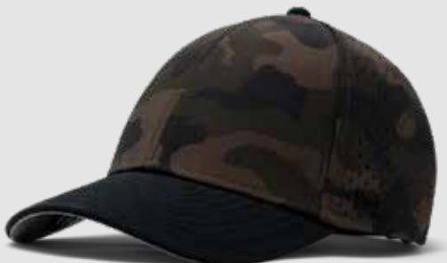
OLIVE CAMO SMALL | CLASSIC | XL