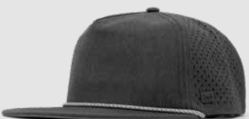
HEATHER CHARCOAL CLASSIC