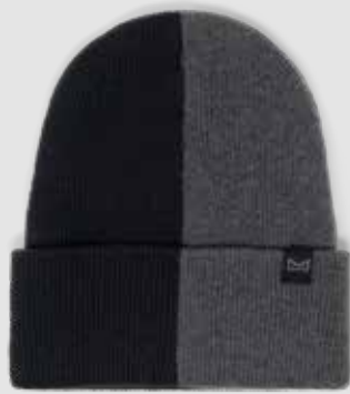
ABYSS OSM AVAILABLE 2026