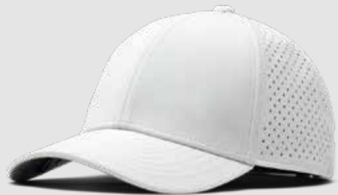
WHITE SMALL | CLASSIC | XL