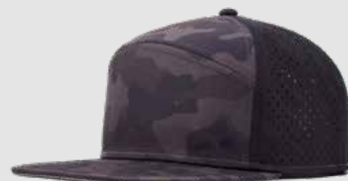
BLACK CAMO CLASSIC