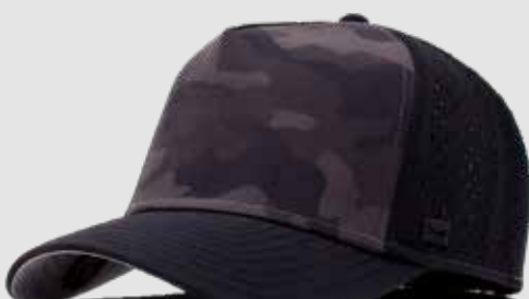
BLACK CAMO CLASSIC