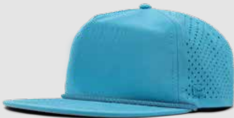
NEON BLUE CLASSIC