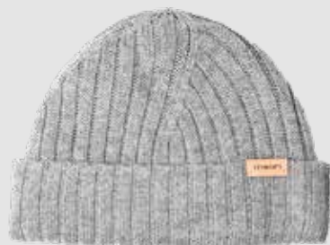
HEATHER GREY OSM