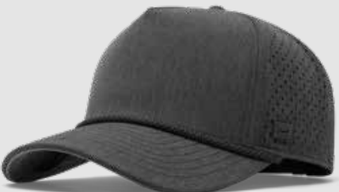
HEATHER CHARCOAL ROPE CLASSIC