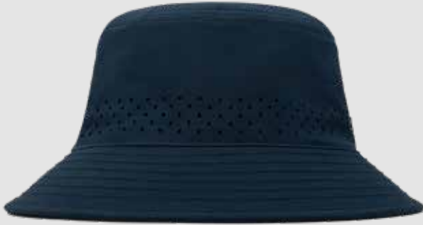
NAVY SMALL | CLASSIC | XL