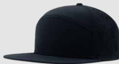
BLACK CLASSIC I XL