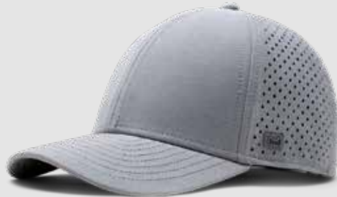
HEATHER GRAY SMALL | CLASSIC | XL