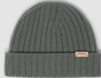
SEAFOAM OSM AVAILABLE 2026