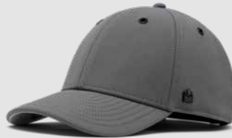
GRANITE GREY SMALL | CLASSIC | XL