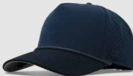
NAVY DARK NAVY ROPE CLASSIC AVAILABLE 2026