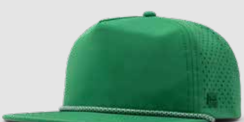
KELLY GREEN CLASSIC AVAILABLE 2026