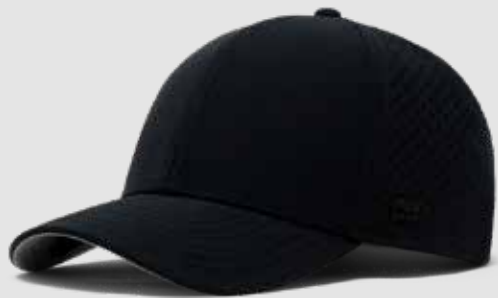
BLACK SMALL | CLASSIC | XL