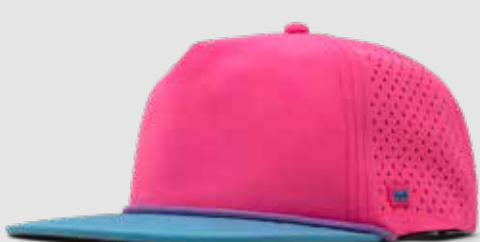
PINK & BLUE NEON CLASSIC AVAILABLE 2026