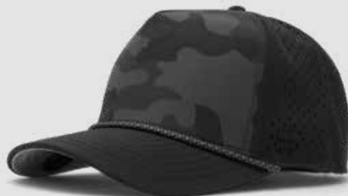
BLACK CAMO ROPE CLASSIC