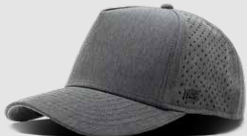
HEATHER CHARCOAL CLASSIC