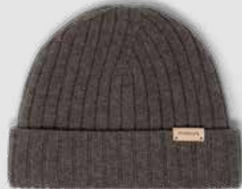
GUNMETAL OSM AVAILABLE 2026