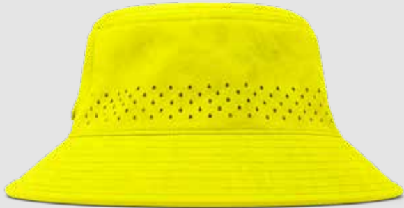
NEON LINKS CLASSIC