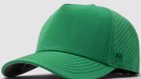
KELLY GREEN CLASSIC AVAILABLE 2026