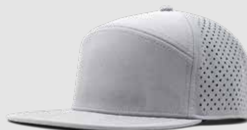
HEATHER GREY CLASSIC AVAILABLE 2026