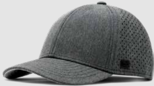
HEATHER CHARCOAL SMALL | CLASSIC | XL