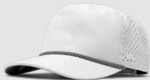
WHITE ROPE SMALL | CLASSIC | XL