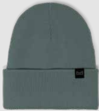
DUSTY SAGE OSM AVAILABLE 2026