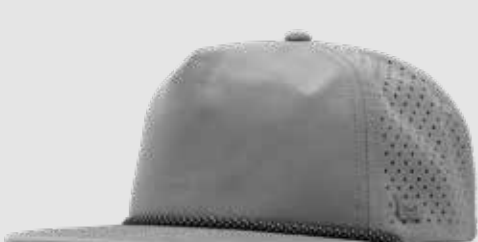
HEATHER GREY CLASSIC