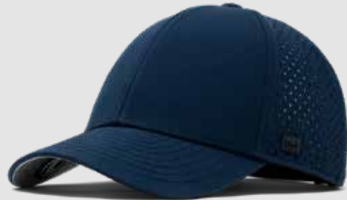
NAVY SMALL | CLASSIC | XL