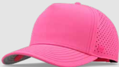
NEON PINK CLASSIC AVAILABLE 2026