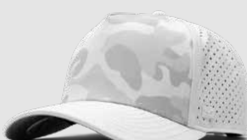
SNOW CAMO CLASSIC