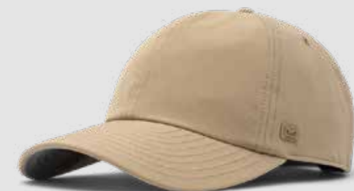
DARK KHAKI CLASSIC