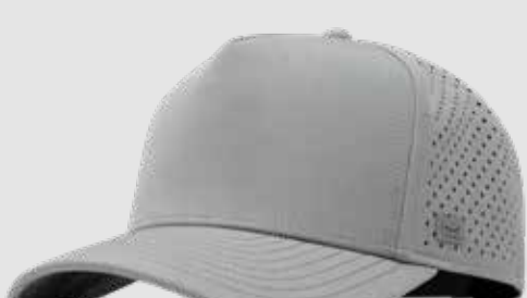
HEATHER GREY CLASSIC AVAILABLE 2026