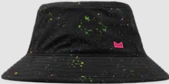
NEON DRIP BLACK SMALL | CLASSIC | XL