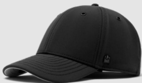
BLACK SMALL | CLASSIC | XL