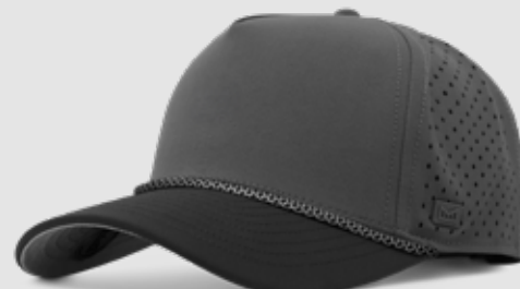
CHARCOAL BLACK ROPE SMALL | CLASSIC | XL