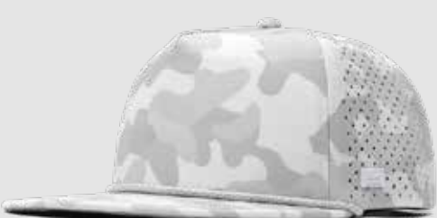
SNOW CAMO CLASSIC