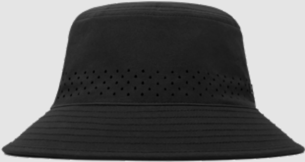
BLACK SMALL | CLASSIC | XL