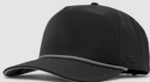
BLACK ROPE SMALL | CLASSIC | XL