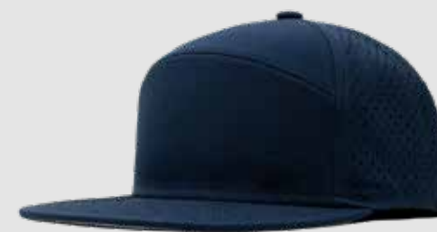
NAVY CLASSIC I XL