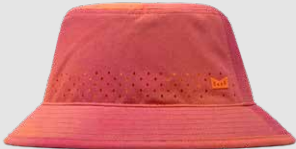
SUNSET AURA SMALL | CLASSIC | XL