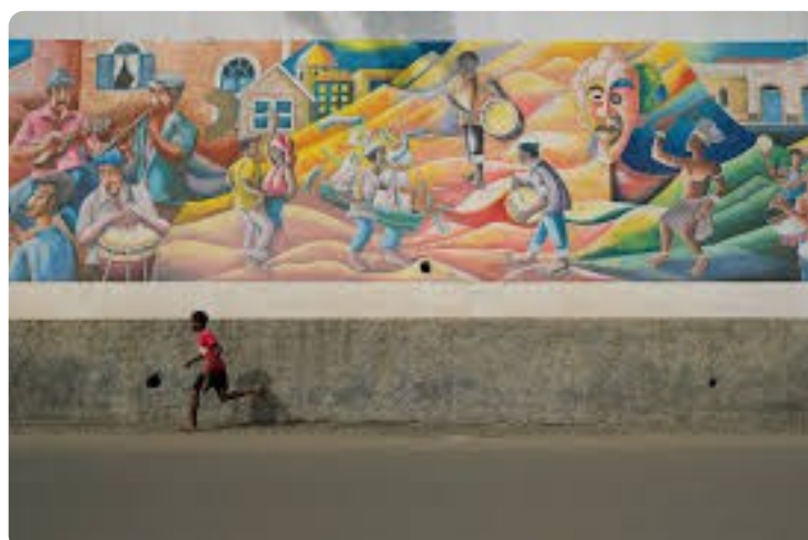
Cape Verde Wall Art

We have been delving into the world of print making when we visited the Woolwich Contemporary Print Fair 2025 in London and saw some extraordinary art including this piece by British Mike Spike 'Significant Minutiae 2021'. We plan to increase our range and work with contemporary European print makers.