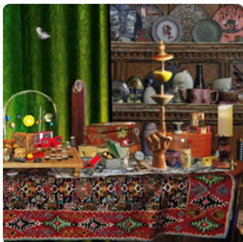
Mike Spike Significant Minutiae 2021 Woolwich Contemporary Print Fair 2025

We have been delving into the world of print making when we visited the Woolwich Contemporary Print Fair 2025 in London and saw some extraordinary art including this piece by British Mike Spike 'Significant Minutiae 2021'. We plan to increase our range and work with contemporary European print makers.