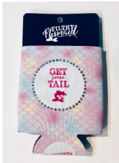
GET SOME TAIL KOOZIE

$59.00 - CHARMED ("MERMAID" ZIPPER PULL)