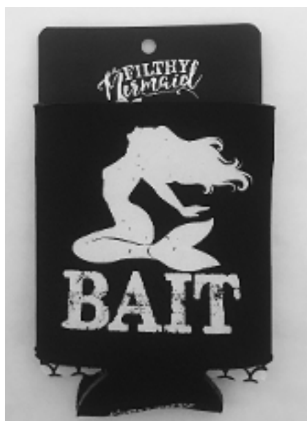
BLACK MERMAID BAIT CAN KOOZIE