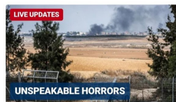
Soldiers detail atrocities in

We also saw Israel fall under attack, ramping up international worries, touching even our nation as people continue to protest, and strife continues over there, the Middle East, and the war in the Ukraine, and drum beats of fear for the Far East.