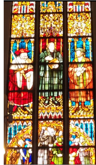
Looking back the past year together— and beyond, and forward

Above you can see on the upper right the picture of the Baptismal Font in Wittenberg where Luther's own children were baptized. This font, the church as well, and more, survive from the 1500s, and multiple wars, and plague, and suffering we have not endured in our land in our lifetimes. The picture though shows powerfully the reminder of holy Baptism, and how the promises of Christ Jesus and his Means of Grace, and the Church itself has continued from the time of the first advent of Christ to this day.