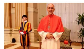
Vatican says bishops allowed to withhold same-sex blessings sanctioned by recent document

Yet in it all, our Lord continues to be faithful to his people. And here we are, beginning 2024 A.D.. And looking back, we can look forward, knowing Jesus is true to his Word, "I am with you always, even to the end of the ages." (ctd next page)