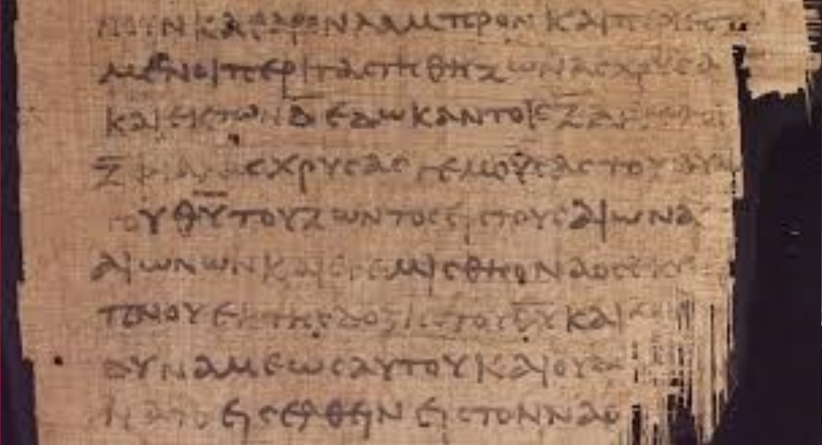
Above is a fragment of P47, from the 200s a.d., and from the Book of Revelation.