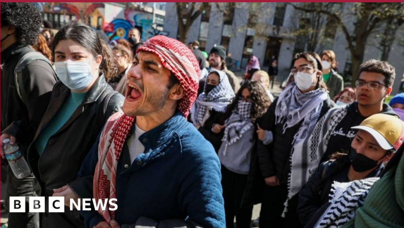
U.S. Campus unrest and antisemitic protests and riots, as police clash to retake campuses in several U.S. cities.