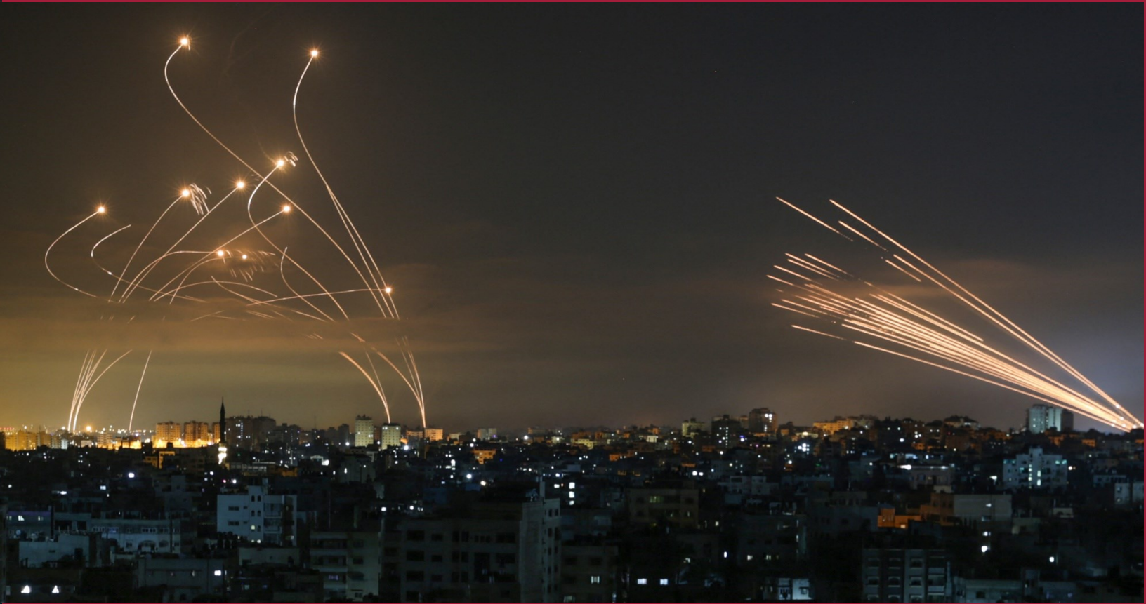
Above: Israel's Iron Dome responds to Iranian Missile Attack. Below: U.S. Navy Carrier Jets respond to defend Israel