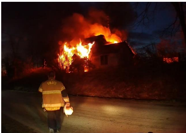
Road 25 Fire screenshot from Chief's DashCam