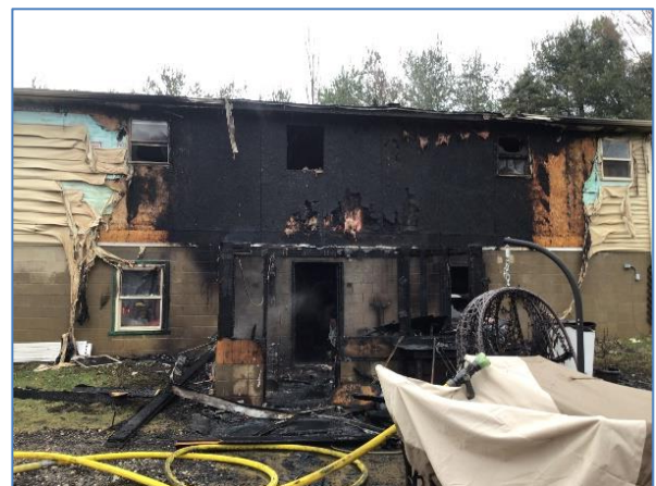
Road 187 photo from investigation