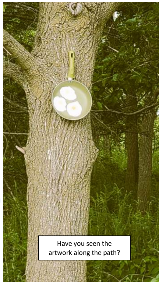
Have you seen the artwork along the path?