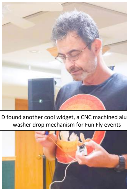
Alex D found another cool widget, a CNC machined aluminum washer drop mechanism for Fun Fly events