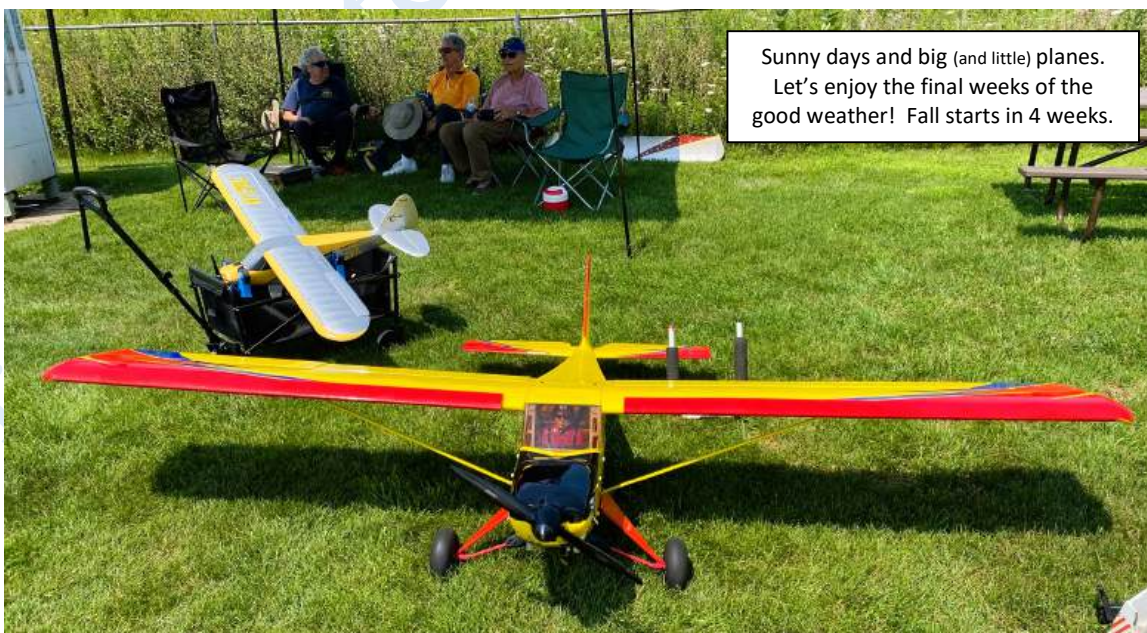
Sunny days and big (and little) planes. Let's enjoy the final weeks of the good weather! Fall starts in 4 weeks.