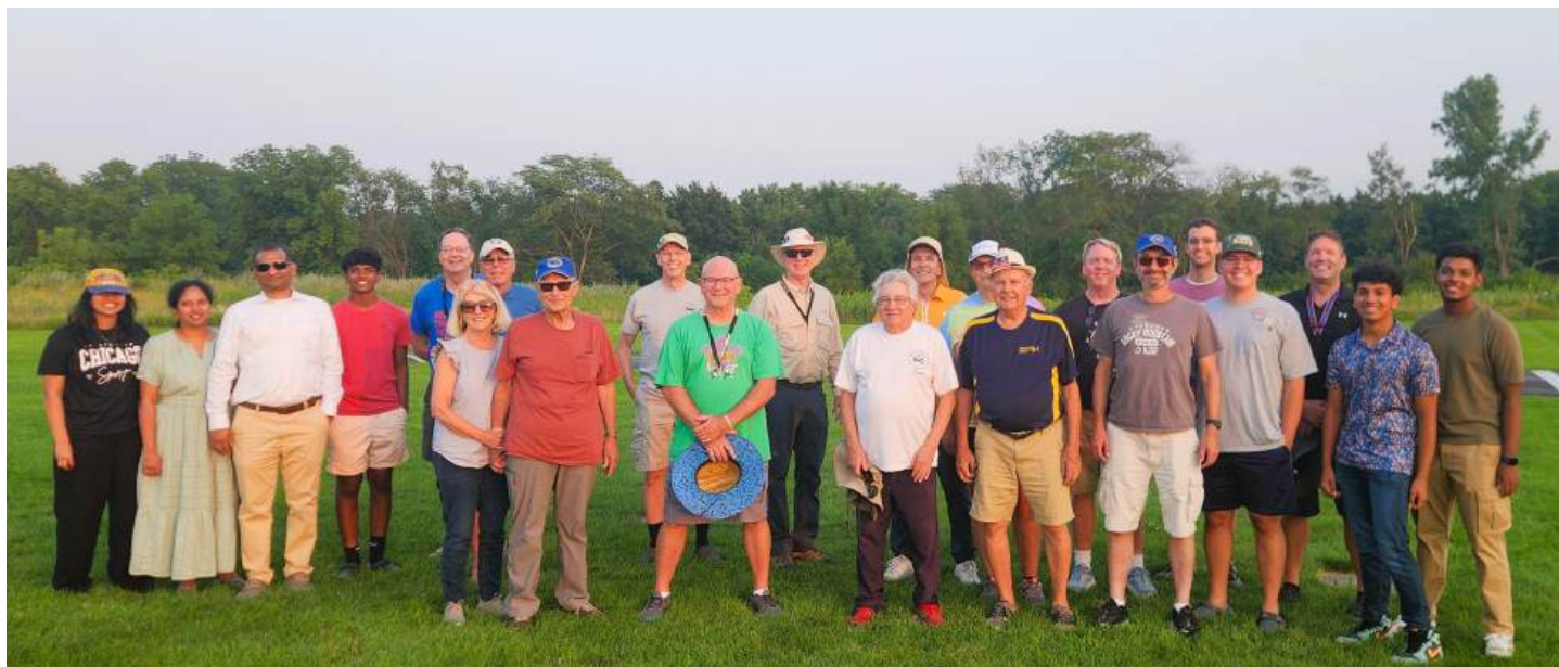
National Night Out Fun Fly – August 5, 2025