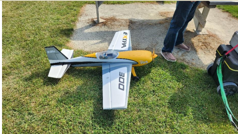
Kirk Alvey's Extra 300.