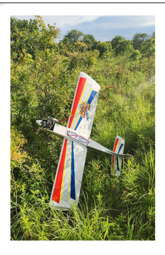
My Easy Sport resting in a tree.