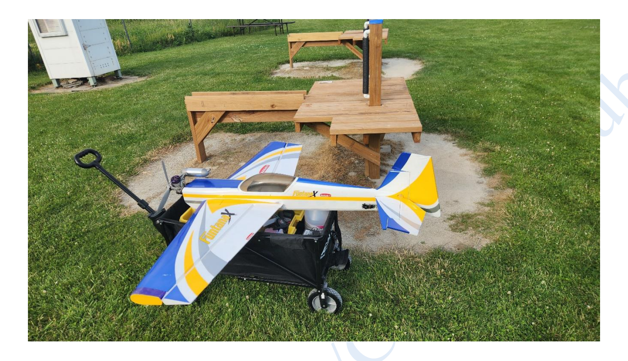
Darrell's Funtana X