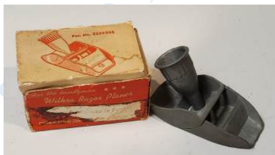
Alex shows the vintage razor plane tool