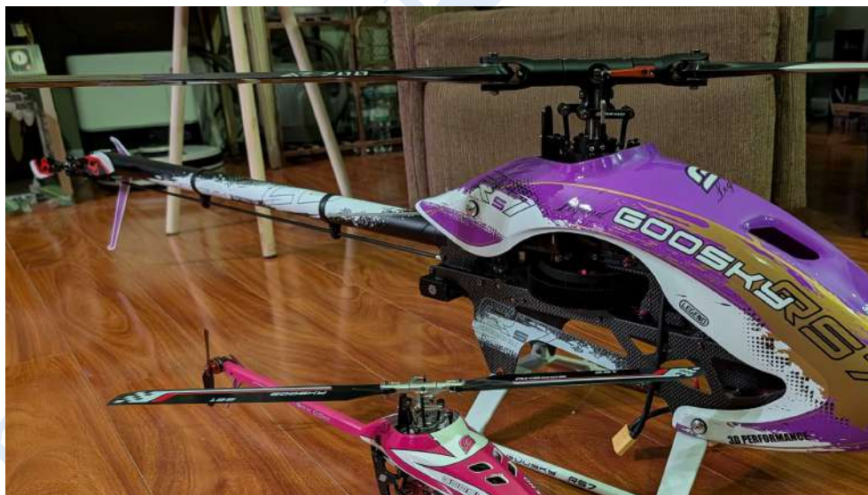
Esther built a Goosky RS7 and has maiden it already. S1 shown for size comparison.