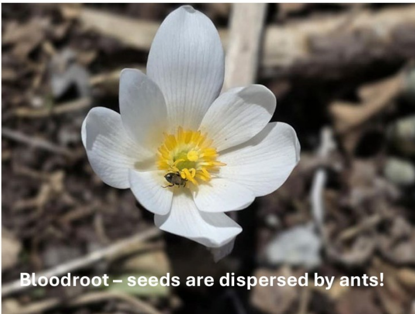
Bloodroot – seeds are dispersed by ants!

I enjoy visiting the garden year-round. Having an extended bloom period from March thru December ensures that various wildlife have the resources they need. We start with willow and alder blooms and end with witch hazel.