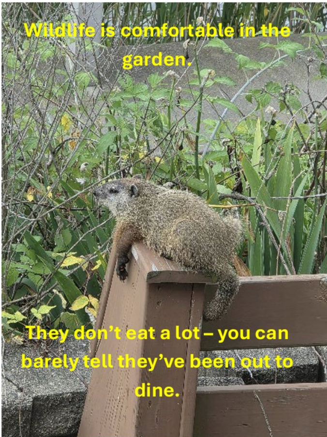
Wildlife is comfortable in the garden.

They don't eat a lot – you can barely tell they've been out to dine.