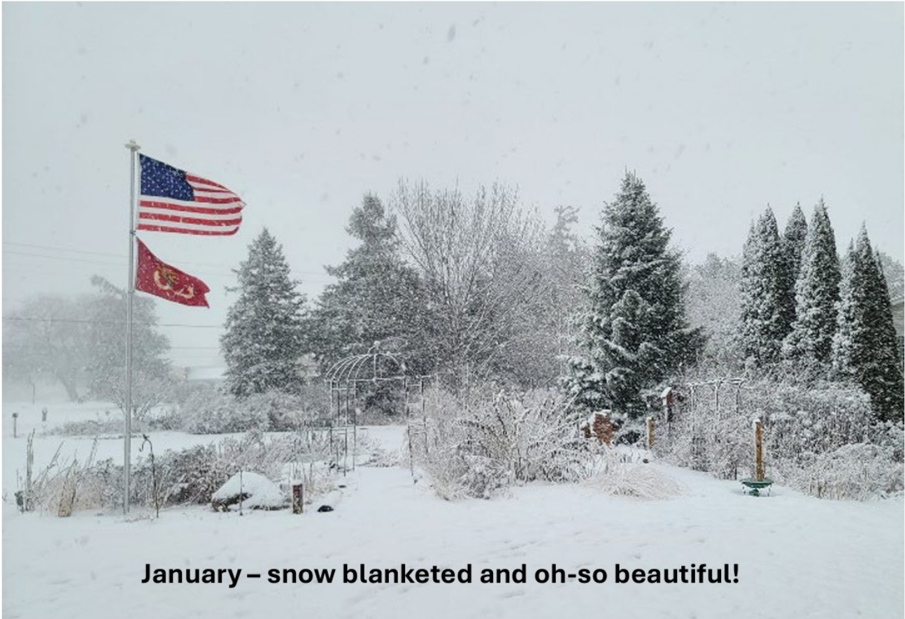
January – snow blanketed and oh-so beautiful!

I love the garden in every season! Join me for my annual in-person garden walk – details at end.