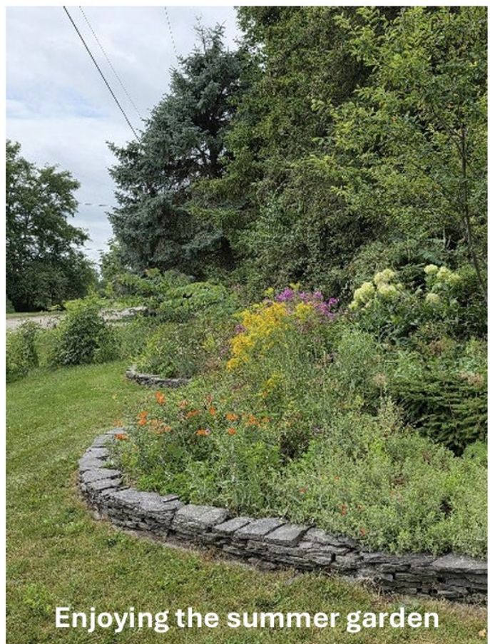
Enjoying the summer garden

They don't eat a lot – you can barely tell they've been out to dine.