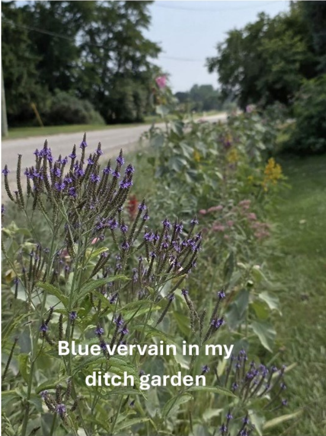
Blue vervain in my ditch garden