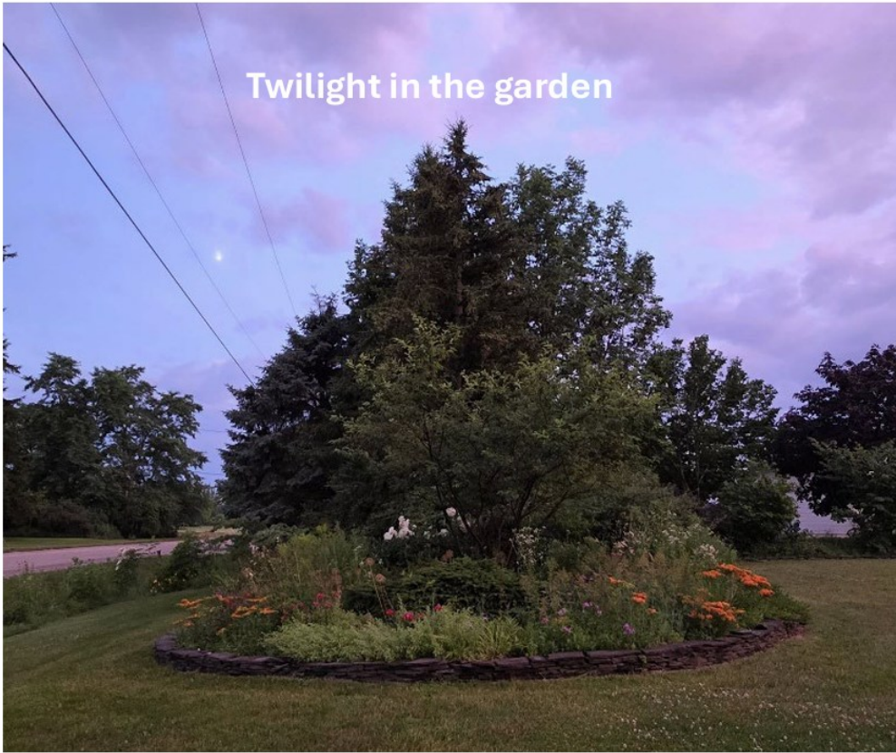
Twilight in the garden

I am an ecological gardener who gardens for wildlife. A couple years ago, my voles were quite happy (at least a dozen!) and thoroughly enjoyed my native bulbs. I'm now trying to replace those plants. I have 300+ native plants species, primarily straight species, local genotype, but a nativar and some nearly native species are also present. We moved here in 2010 and started the roadside garden in 2012.