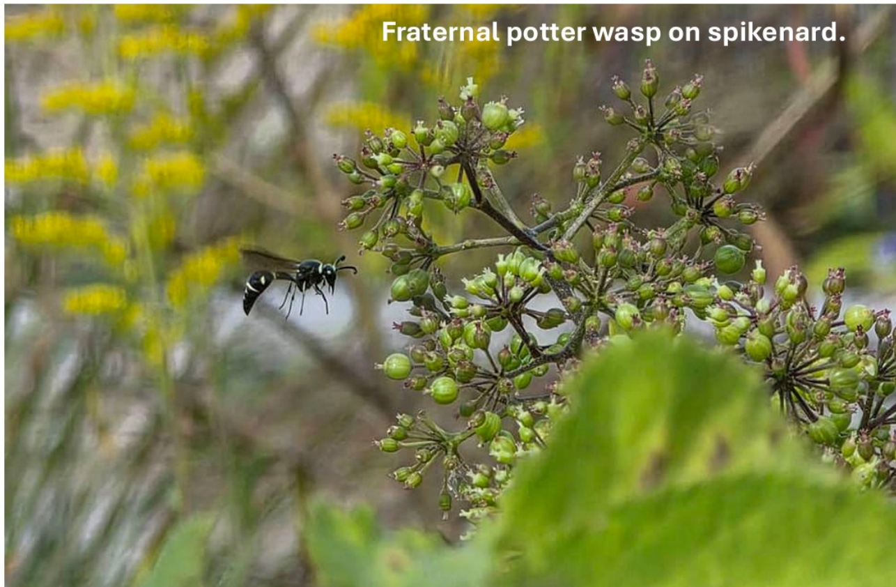
Fraternal potter wasp on spikenard.