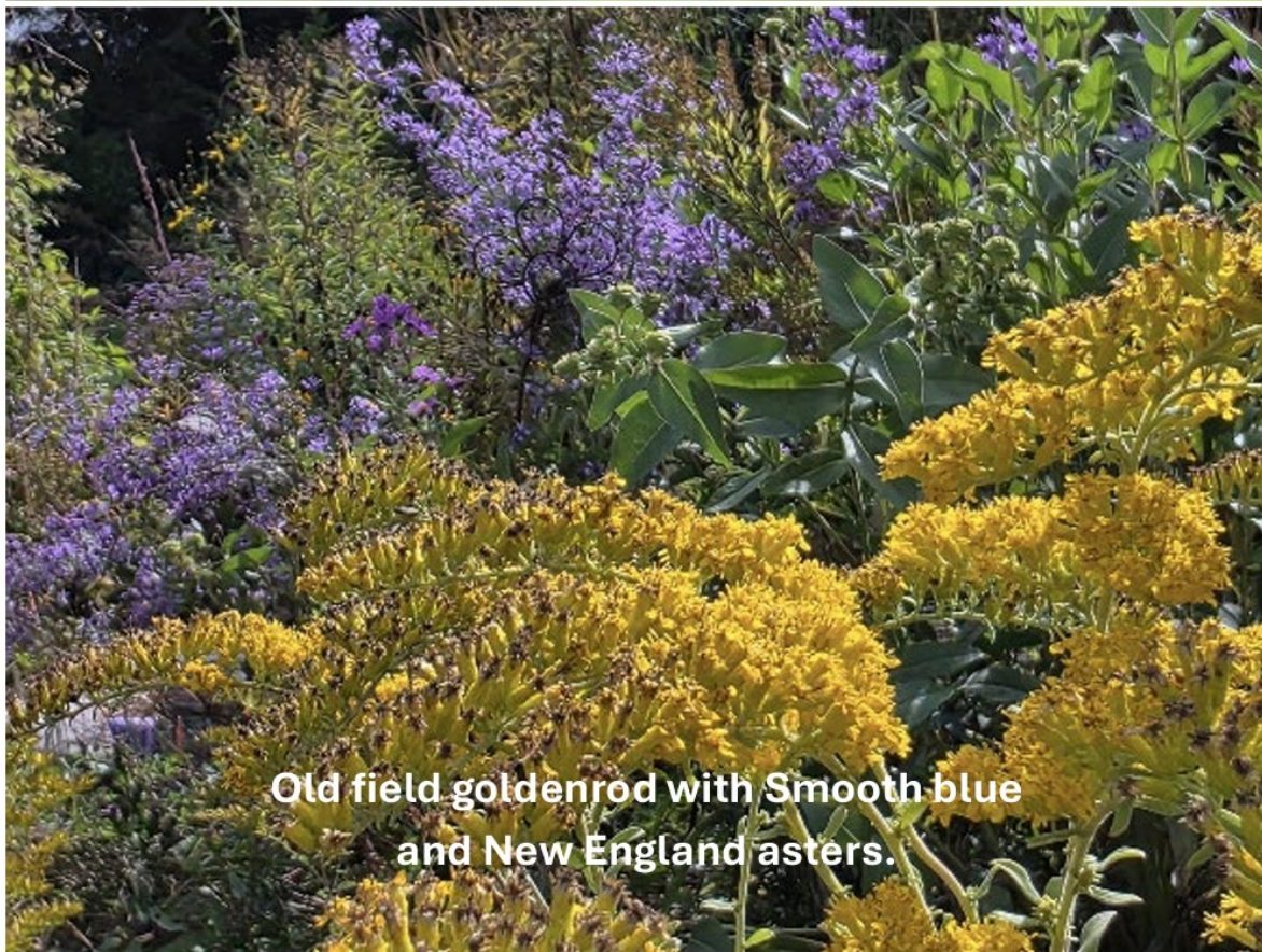
Old field goldenrod with Smooth blue and New England asters.

Save the date! July 25 th , 10 am to 1 pm, join me for a garden walk and native plant sale!