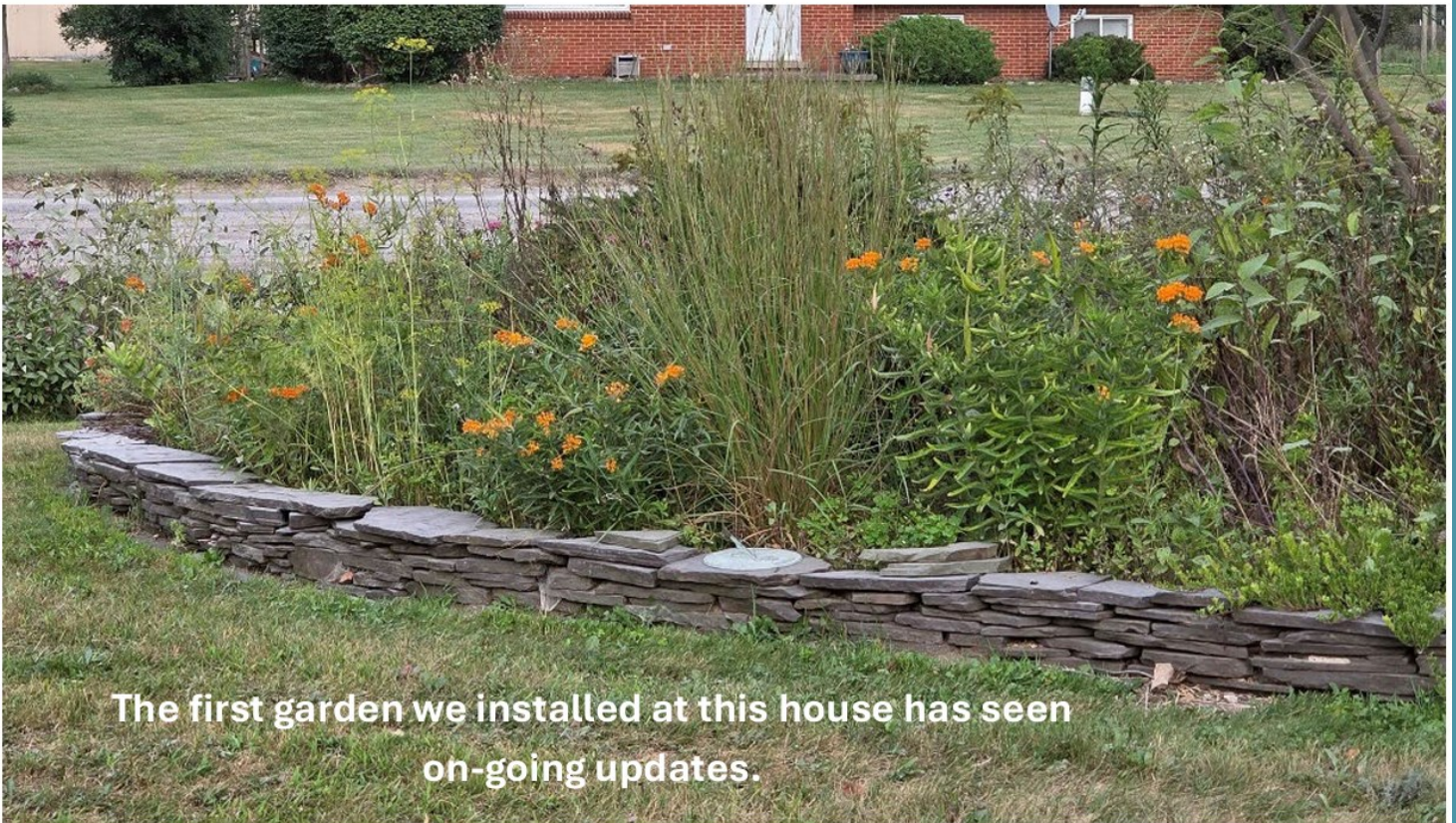
The first garden we installed at this house has seen on-going updates.