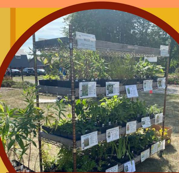
In the photo to the left, there are several of the plants for wet spaces that were available for purchase at the Native Plant Sale