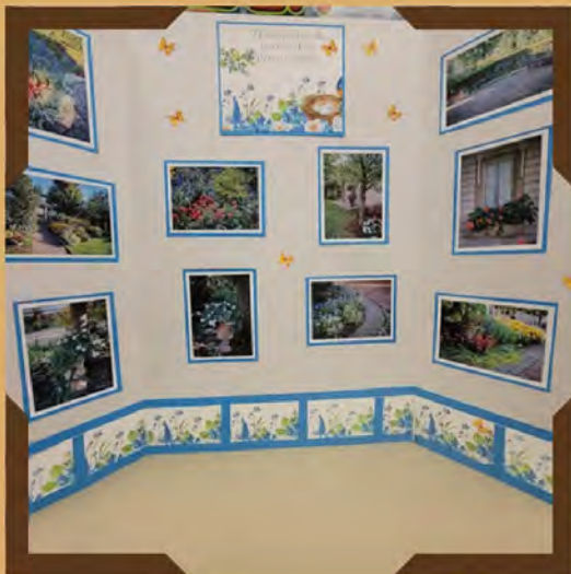
MSUE Polinator Garden