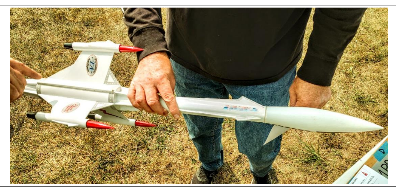
Um, can anyone tell me where the Center of Gravity and Center of Pressure are??????