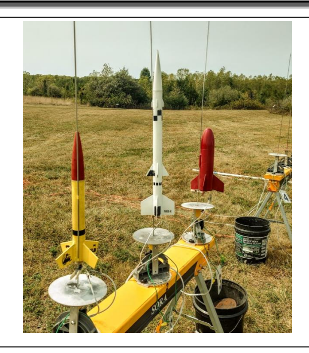
Nice paint jobs!