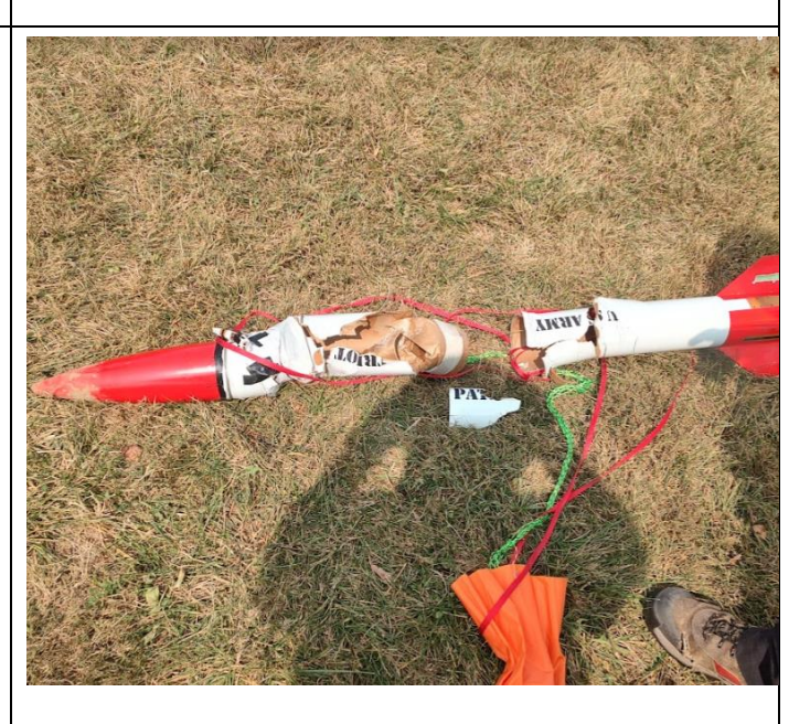
Where RockSim simulations and reality colide...