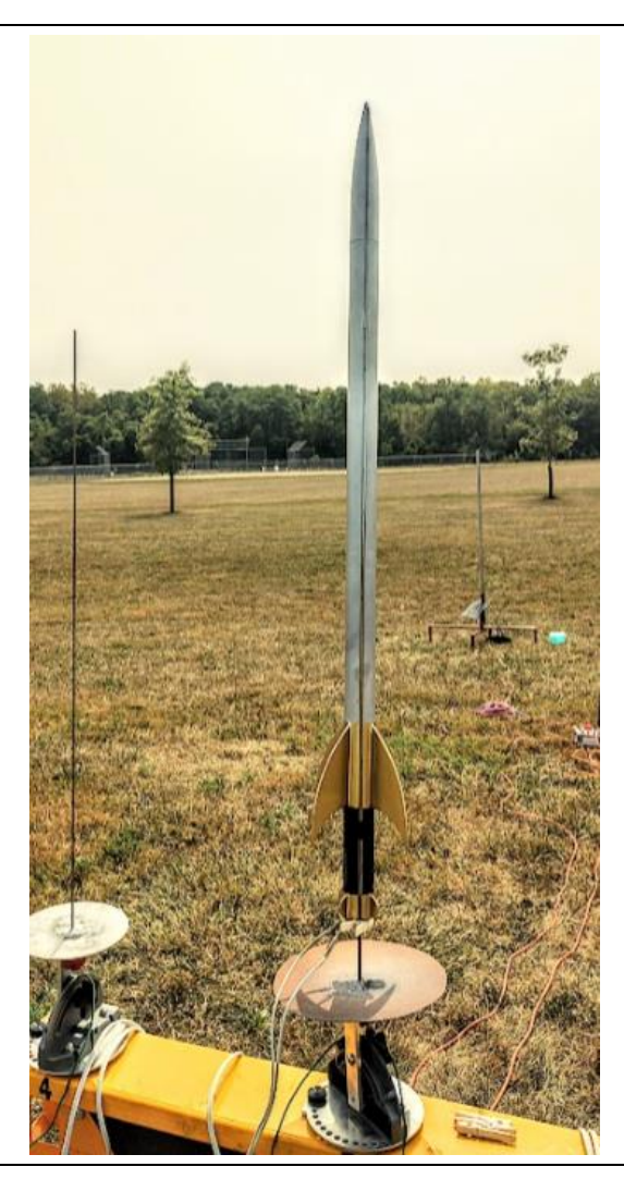
Merlin Missile Works Silver Sword