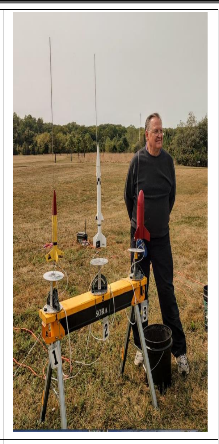
Born Again Rocketeers were plentiful today