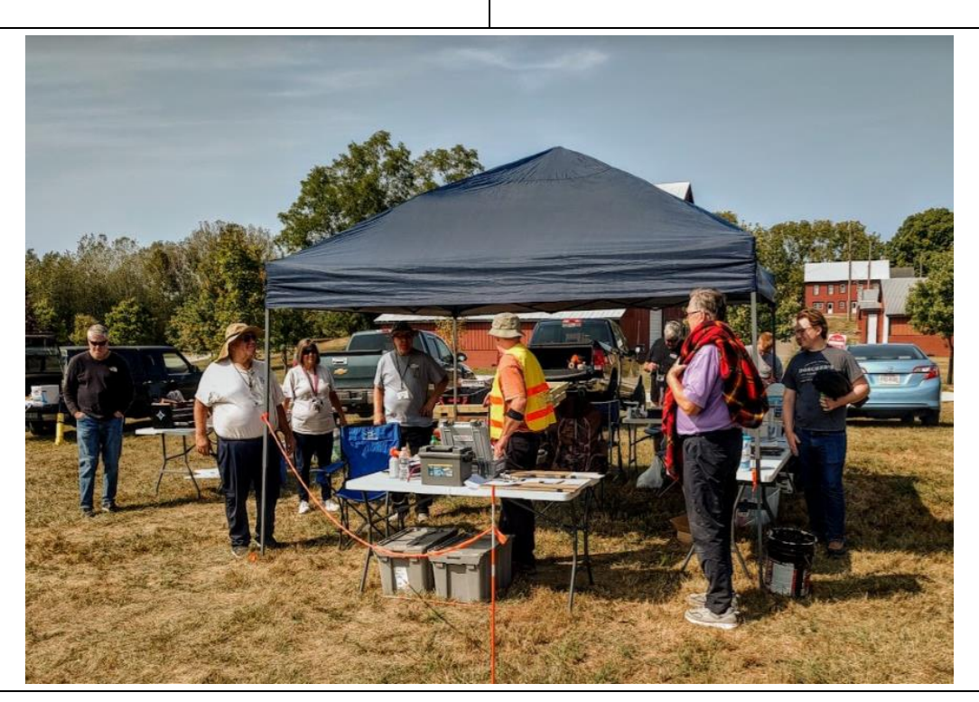
Sharing knowledge at the RSO table