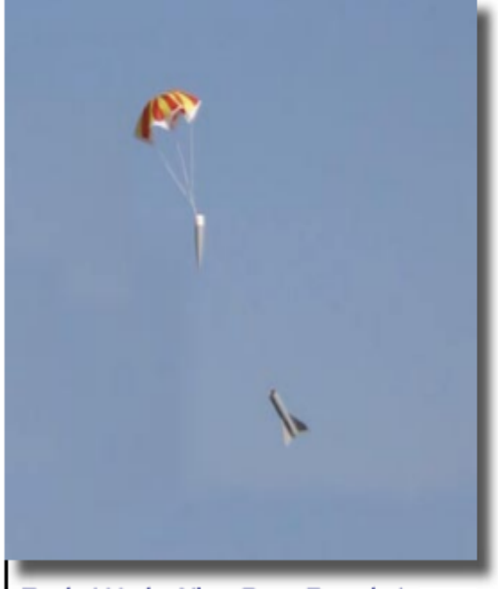
Rocket Under Nice, Open Parachute

Parachutes can be used on almost any size rocket. A parachute can control the model's descent speed more accurately and bring the model down more slowly