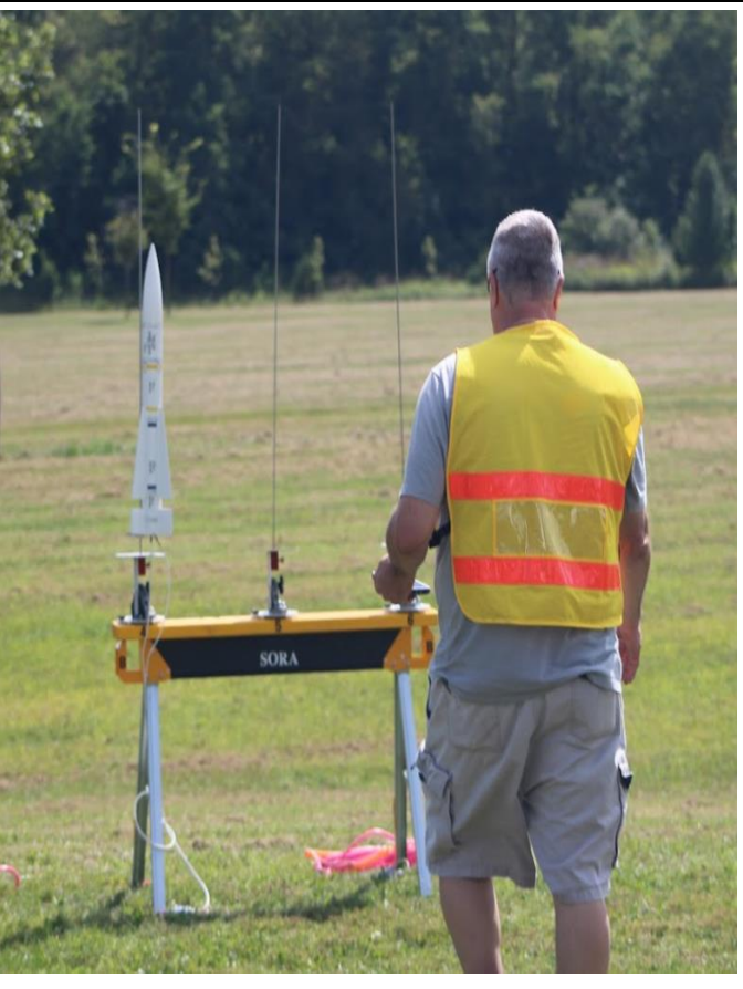
Checking on the Phoenix.