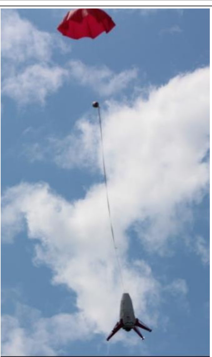
Mars Landers on a C6-3