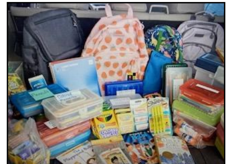
A trunk full of school supplies ready to be delivered to Hanson Elementary