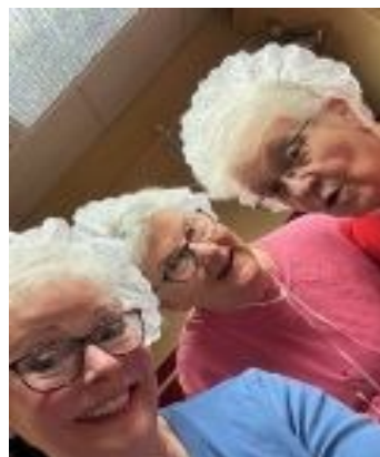
The Q-Tips Comedy Group

Our business meeting will begin at 12:30. MEA-Retired members will be voting on Resolutions and Bylaws