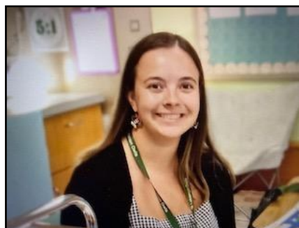
A first year teacher and former recipient of a YCREA scholarship

This is our 16th year of developing and carrying out Day of Caring projects. We have to give a big shoutout to our members who, every year, exceed our expectations to do "Something Special" for a school in our county.