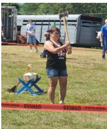
A member of the Axe Loggers from breakout session presenters

low shortly from 10:35- 11:10 and then from 11:20-11:55.