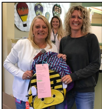
The Androscoggin Retired Educators Association provided backpack filled with school supplies for schools in the area.

There is also a Gorham School District Locker Project—founded and operated by