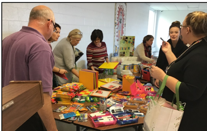
Members of AREA provided a large variety of classroom supplies for teachers and students in the Van Buren Elementary School. "Thank you" gift bags containing $25 were presented to the teachers to get items that would be helpful in their classrooms.