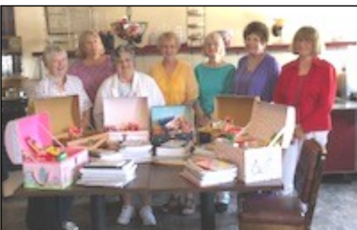
Members of the Washington County Retired Teachers Association participated in the statewide Day of Caring program. They purchased a variety of school supplies and filled treasure chests for students and teachers in five area schools.

In addition, individuals recognized active educators in our county for Teacher Appreciation Day and others plan to do the same during American Education Week from November 11-15.