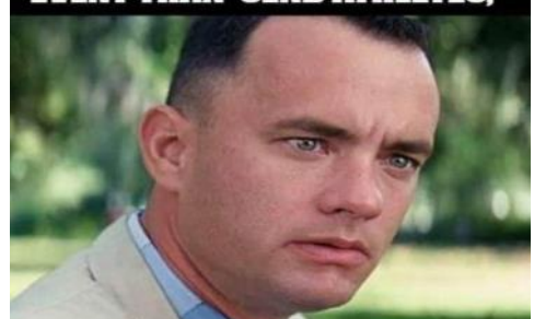
THAT ARE ASHAMED TO REPRESENT THE COUNTRY THAT GAVE THEM THAT OPPORTUNITY.

Breaking News: Joe Biden has tested positive for the Moronavirus.