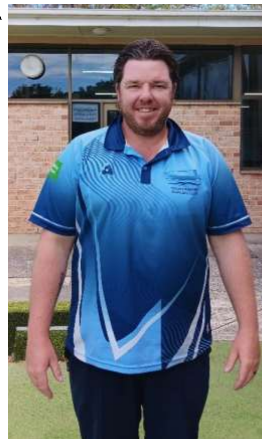
Club Championship Men's Pairs winners.