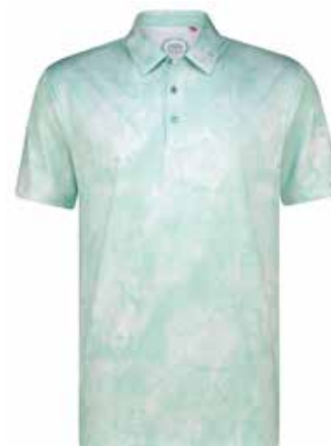
SP258 PEPPERMINT / WHITE