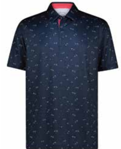
SP257 NAVY / VIRTUAL PINK