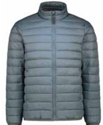
JKT081 DARK GREY