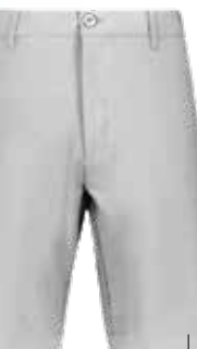
STYLE : TR13 BERMUDA'S PLATINUM