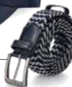
STYLE : BELT712 BRAIDED STRETCH BELT NAVY / PLATINUM