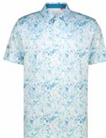
SP255 WHITE / PETROL