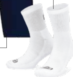
STYLE : SOCK712M SHORT SOCK WHITE