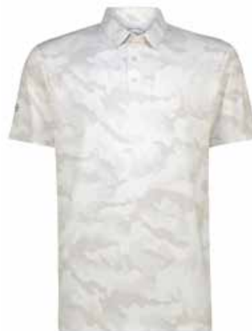
SP252 LILY WHITE

INTRODUCING THE NEW AVENTUS - A TRUE GAME-CHANGER IN PERFORMANCE AND STYLE. FEATURING ADVANCED SEAM-SEALED HEMMING TECHNOLOGY, LASER-CUT BUTTONHOLES, AND A SEAM-SEALED COLLAR, THIS GOLFER COMBINES PRECISION CRAFTSMANSHIP WITH UNPARALLELED COMFORT. DESIGNED TO WICK AWAY MOISTURE, IT KEEPS YOU FEELING FRESH AND COLLECTED, EVEN IN THE HEAT OF THE MOMENT. WHETHER YOU'RE NAVIGATING THE URBAN JUNGLE OR CONQUERING THE GOLF COURSE, AVENTUS ENSURES YOU STAY COOL, COMPOSED, AND ALWAYS IN STYLE.