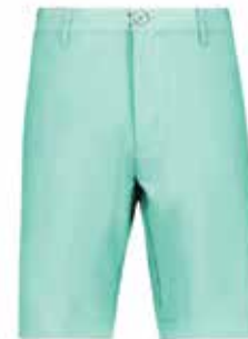
TR13 TRANQUILITY BLUE