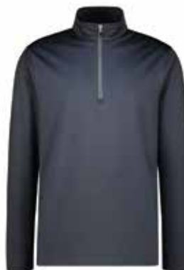
P358 DARK GREY

UNRESTRICTED MOVEMENT, AND LASTING COMFORT THE HIGH COLLAR PROVIDES ADDED COVERAGE, WHILE THE MOISTURE-WICKING FINISH KEEPS YOU DRY FROM WARM-UP TO COOLDOWN.