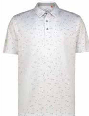
SP257 WHITE / COOL GREY

ELEVATE YOUR PERFORMANCE AND STYLE WITH THE SUMMER VIBES DRY TECH X POLO SHIRT. DESIGNED FOR THOSE WHO BRING HEAT TO THE COURSE AND COOL TO THE CLUBHOUSE. CRAFTED WITH MOISTURE-WICKING DRY TECH X FABRIC, THIS SHIRT KEEPS YOU DRY, LIGHT, AND FRESH THROUGH EVERY SWING, EVEN ON THE HOTTEST DAYS.