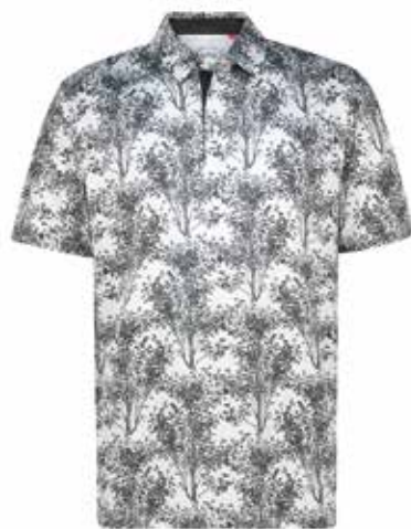
SP257 WHITE / BLACK

ENGINEERED WITH ADVANCED MOISTURE-WICKING DRY TECH X FABRIC, THIS POLO KEEPS YOU DRY, COOL, AND COMFORTABLE FROM THE BOARDROOM TO THE BACK NINE.