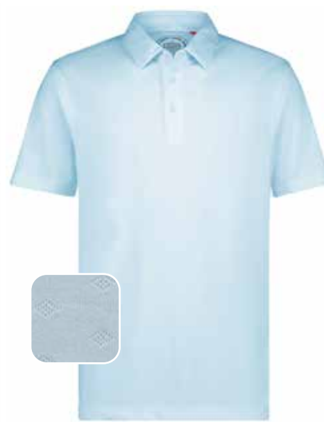
SP239 CORN FLOWER