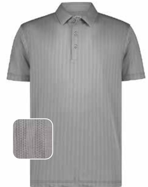
SP238 COOL GREY