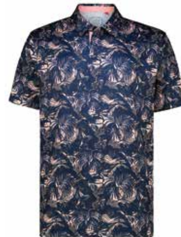
SP256 POWDER / BISCAI