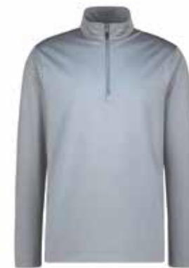
P358 QUARRY GREY