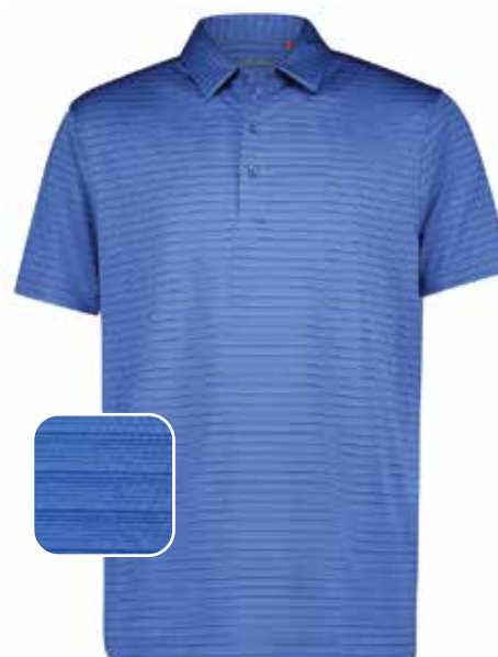
SP237 BLUE MELANGE