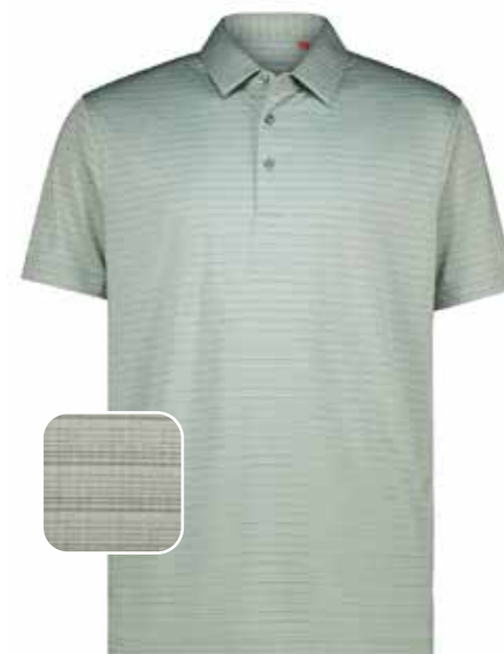
SP237 GREY MELANGE