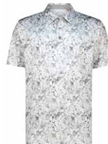
SP255 WHITE / COOL GREY