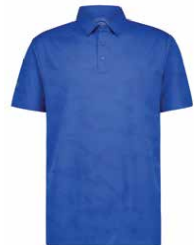
SP252 ELECTRIC BLUE