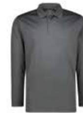
SP005 DARK GREY