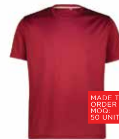
TSM001 FIRED BRICK