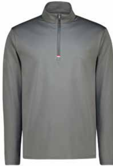
P365 GREY MELANGE