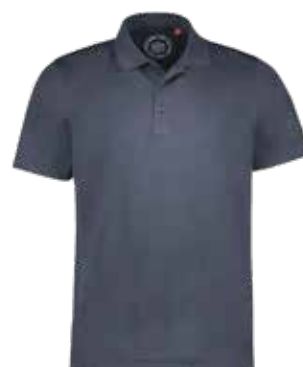
SP003 DARK GREY