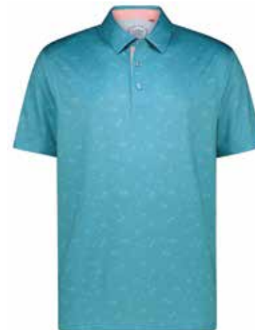
SP257 MAUI BLUE / CANDY PINK