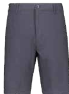
TR13 DARK GREY