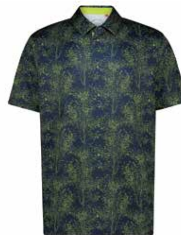
SP257 NAVY / GECKO