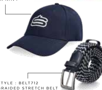
STYLE : CAP728S FLEX FIT CAP DARK NAVY