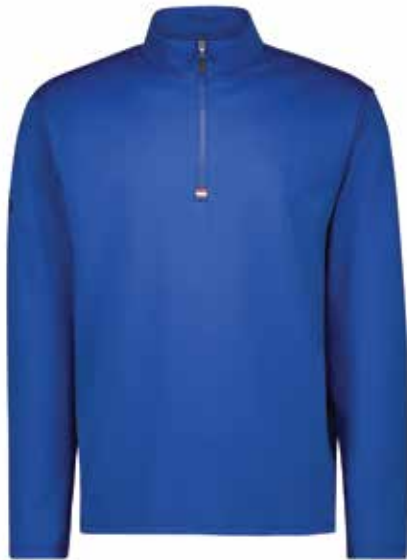
P365 DEEP BLUE