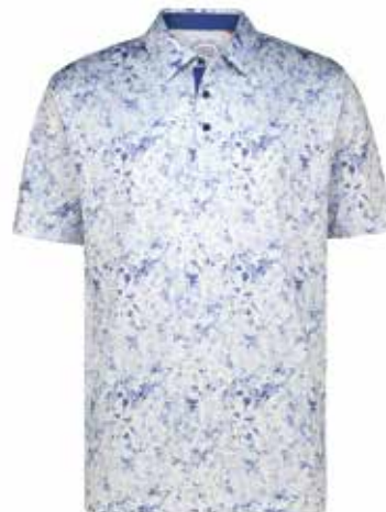
SP255 WHITE / BLUE CHINA