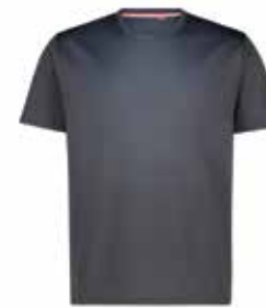
TSM001 DARK GREY