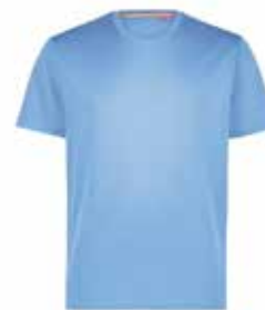
TSM001 SKY BLUE