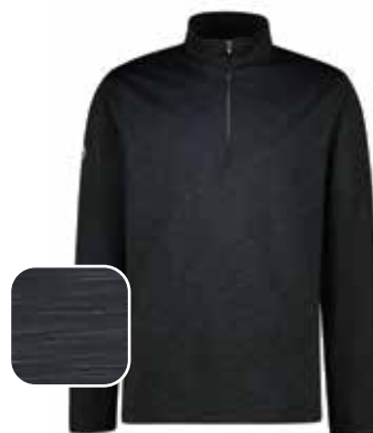
P359 BLACK SPACE- DYE

UNRESTRICTED MOVEMENT, AND LASTING COMFORT THE HIGH COLLAR PROVIDES ADDED COVERAGE, WHILE THE MOISTURE-WICKING FINISH KEEPS YOU DRY FROM WARM-UP TO COOLDOWN.