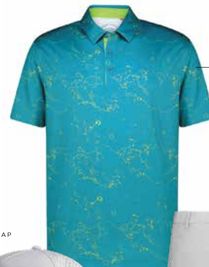
STYLE : SP253 MARBLED BISCAY / GECKO