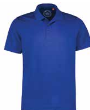
SP003 ELECTRIC BLUE