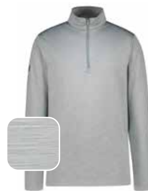
P359 GREY SPACE- DYE