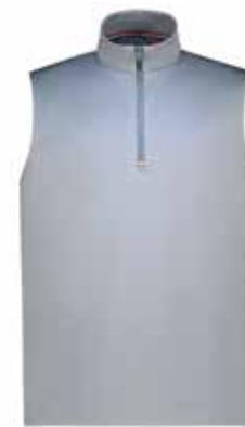
P361SLV QUARRY GREY