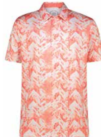
SP254 OCEANA / WHITE