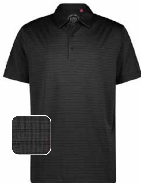
SP237 BLACK MELANGE

THE STREAK POLO IS ENGINEERED TO EFFECTIVELY TRANSPORT MOISTURE AWAY FROM THE BODY TO HELP YOU KEEP DRY AND COMFORTABLE WHILE ENJOYING AN ACTIVE LIFESTYLE.