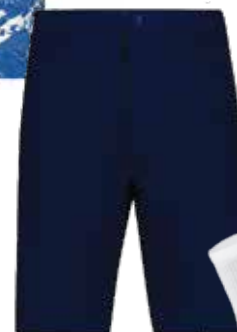
STYLE : TR13 BERMUDA'S NAVY