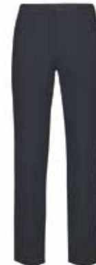
TR10 DARK GREY