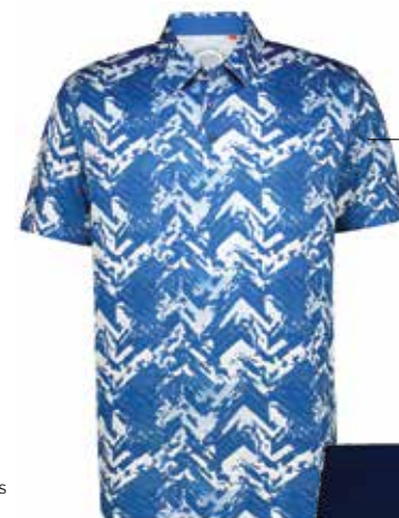
STYLE : SP254 IKAT OCEANA/WHITE