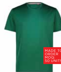
TSM001 FOREST GREEN