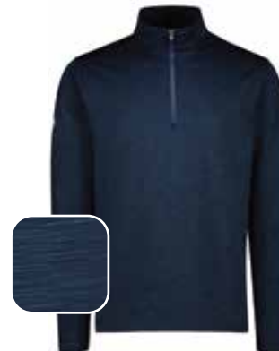
P359 NAVY SPACE- DYE