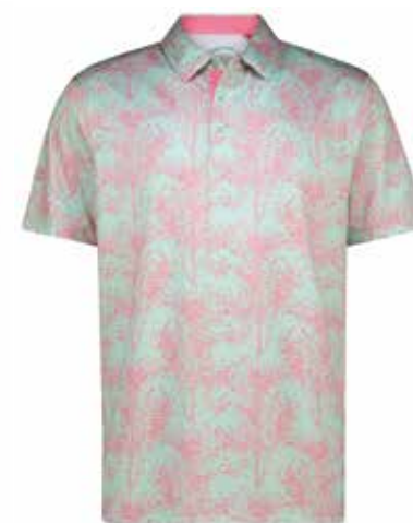
SP257 ICY MORN / VIRTUAL PINK