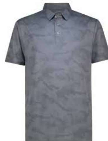
SP252 DARK GREY