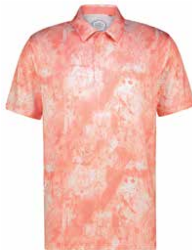
SP258 TIGERLILY / WHITE

ENGINEERED WITH ADVANCED MOISTURE-WICKING DRY TECH X FABRIC, THIS POLO KEEPS YOU DRY, COOL, AND COMFORTABLE FROM THE BOARDROOM TO THE BACK NINE.