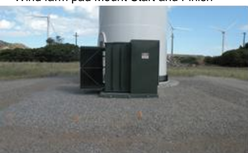
Wind farm pad Mount Start and Finish