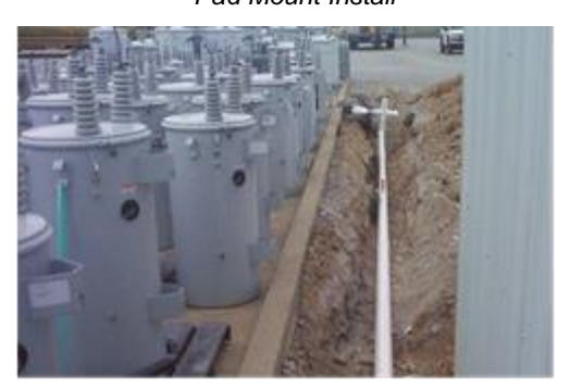
Pad Mount Install