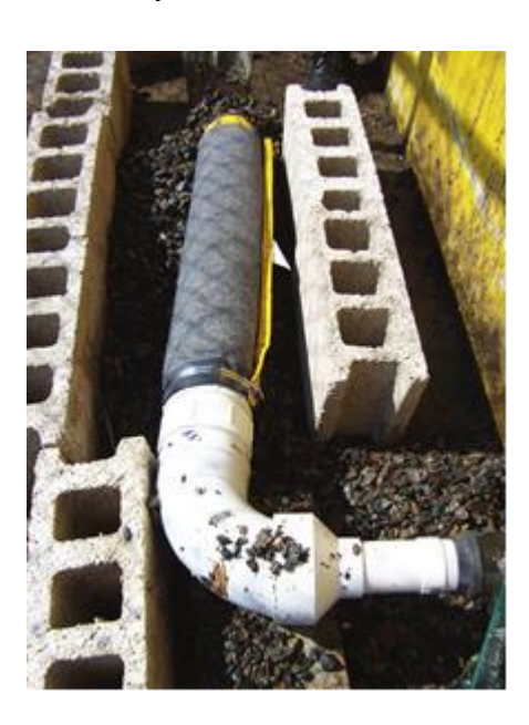
Pad Mount Install