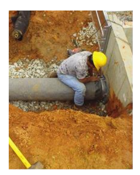
Water Gate Install