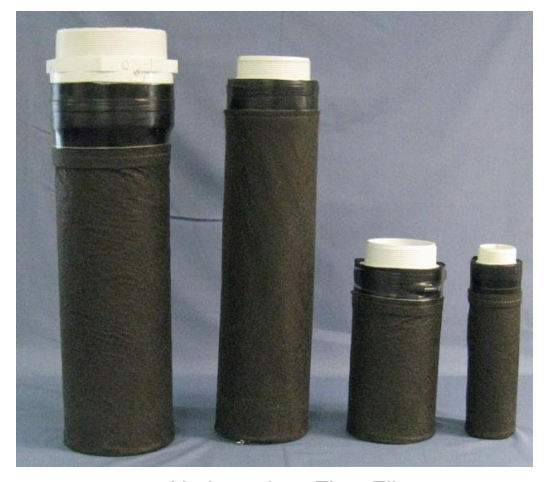
Hydrocarbon Flow Filter