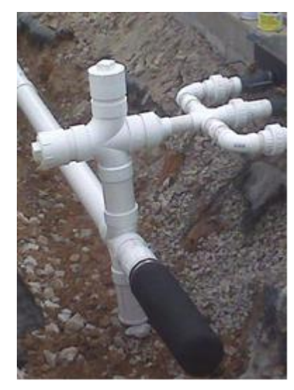
Install with Manifold