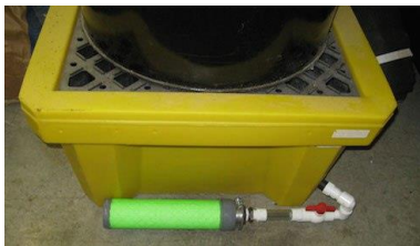
A C.I.Agent® Hydro Sheen Filter used with indoor containment.

The C.I.Agent® Hydro Sheen Filter safely allows water to be processed and released from portable containment systems and spill berms while capturing light to heavy sheen. Can be used anywhere water has to be processed; construction sites, industrial sites, warehouses, coal mines, marinas, etc.