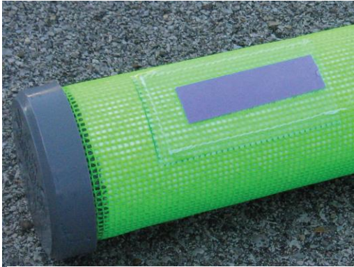
A C.I.Agent® Hydrocarbon Detection Strip fits snugly against the outer skin of the filter to indicate when the filter is spent.