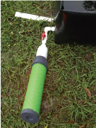
A C.I.Agent® Hydro Sheen Filter used with outside containment.

The C.I.Agent® Hydro Sheen Filter uses state-of-the-art filtration technology to polish sheen from indoor or outdoor water discharge operations of portable containment, spill berms, spill pallets and more. The filtering media is C.I.Agent® Agent-Q (U.S. Patent No. 8,986,822), a high-strength, lightweight hydrophilic spun bond, nonwoven fabric with C.I.Agent® Oil Solidifying Polymers embedded between quilted layers. Water is allowed to flow freely through the filter while preventing hydrocarbons from being released into the environment. A C.I.Agent® Hydrocarbon Detection Strip is placed against the skin of the filter media and will turn a darker color when the filter is spent and needs to be changed. A zinc strip is added to retard the growth of algae and mold. The Hydro Sheen Filter is easy to install over threaded or non-threaded outlet pipe. A pre-filter is provided that fits neatly onto the inside discharge drain.