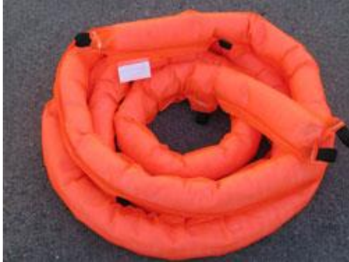
Sheen Boom is available in custom lengths