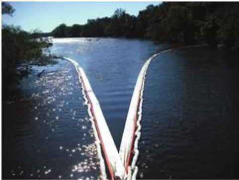
Sheen Boom deployed on River System