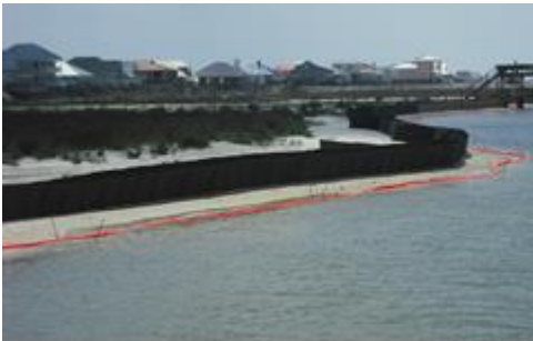
Sheen Boom deployed along north shoreline of Dauphin Island, Ala., after Deepwater Horizon Oil Spill 2010